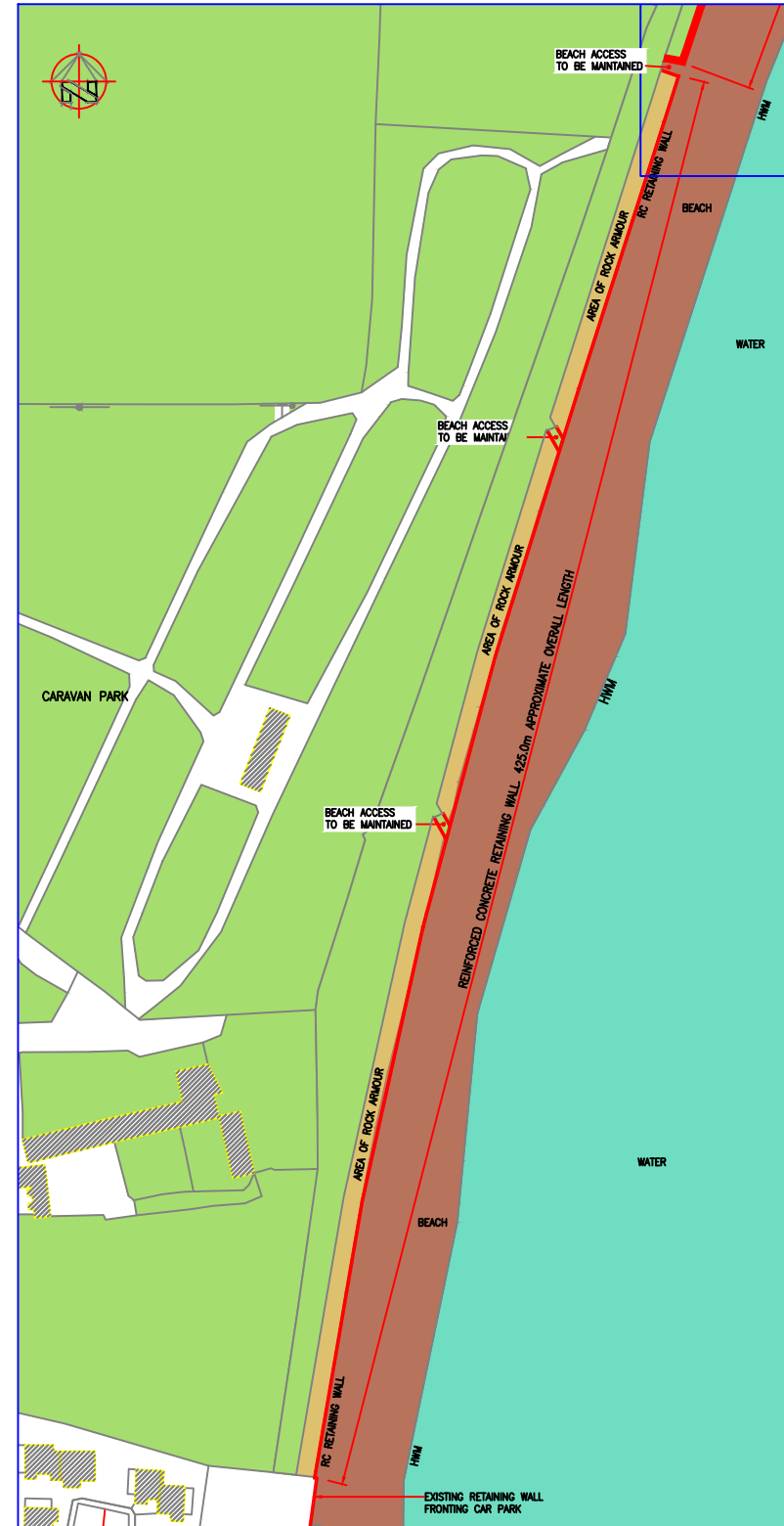
PROPOSED LAYOUT PLAN SCALE 1:1000