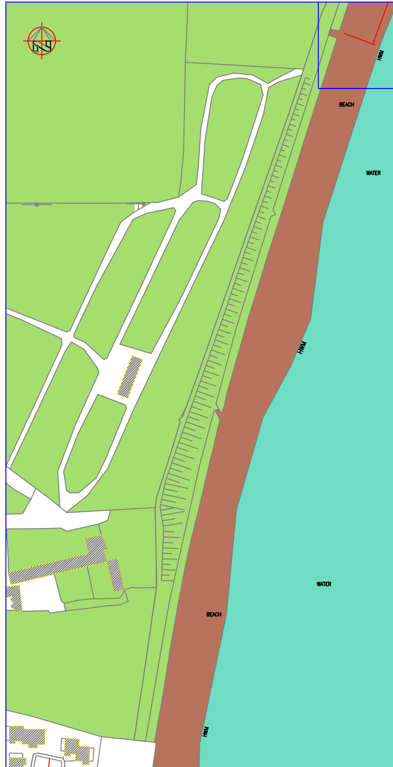
EXISTING LAYOUT PLAN SCALE 1:1000