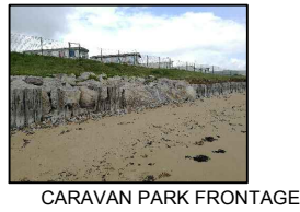
VIEWES OF EXISTING TIMBER RETAINING WALL