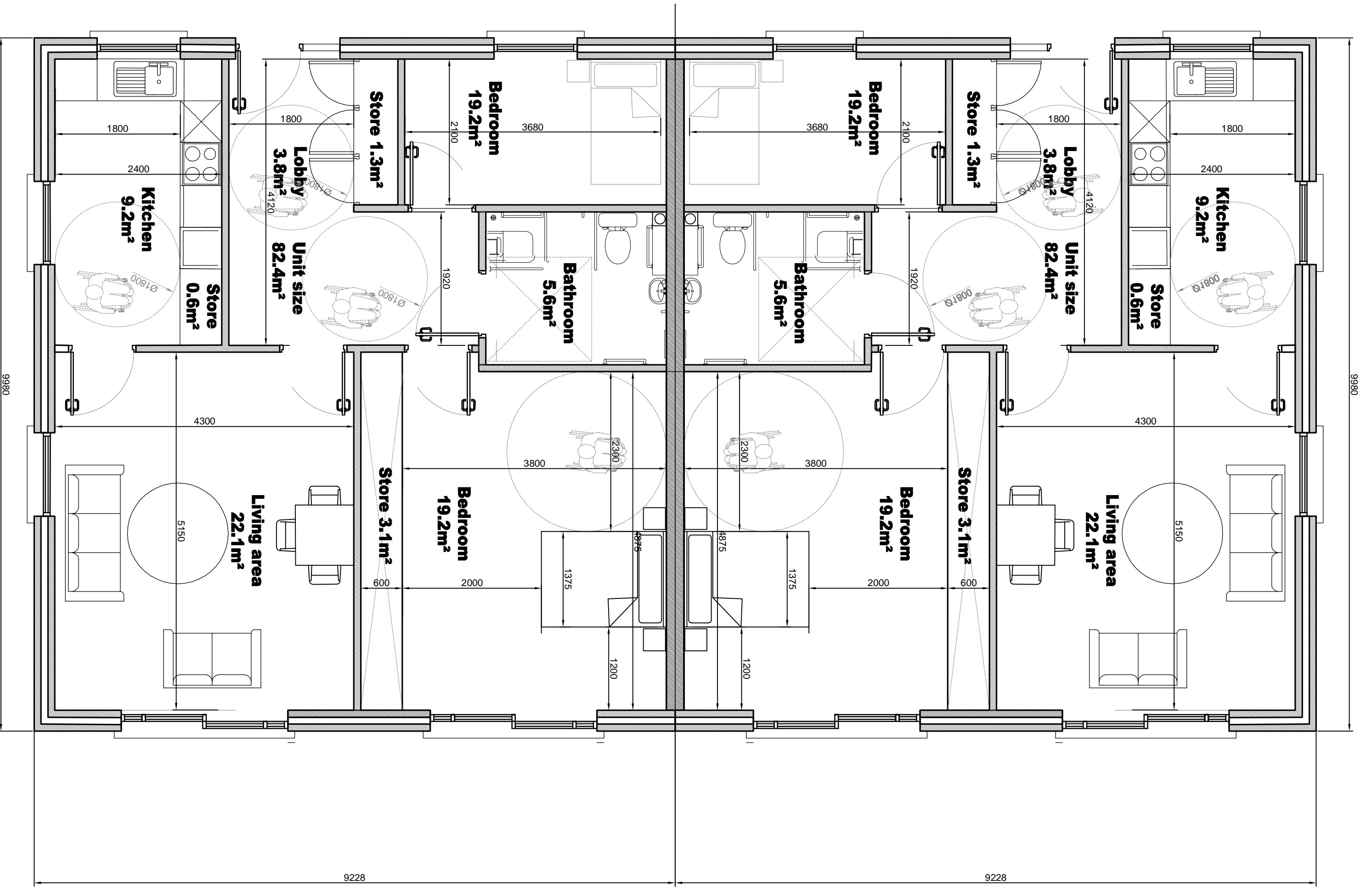
01 Ground Floor Plan-Semi Detached 1.13 Units