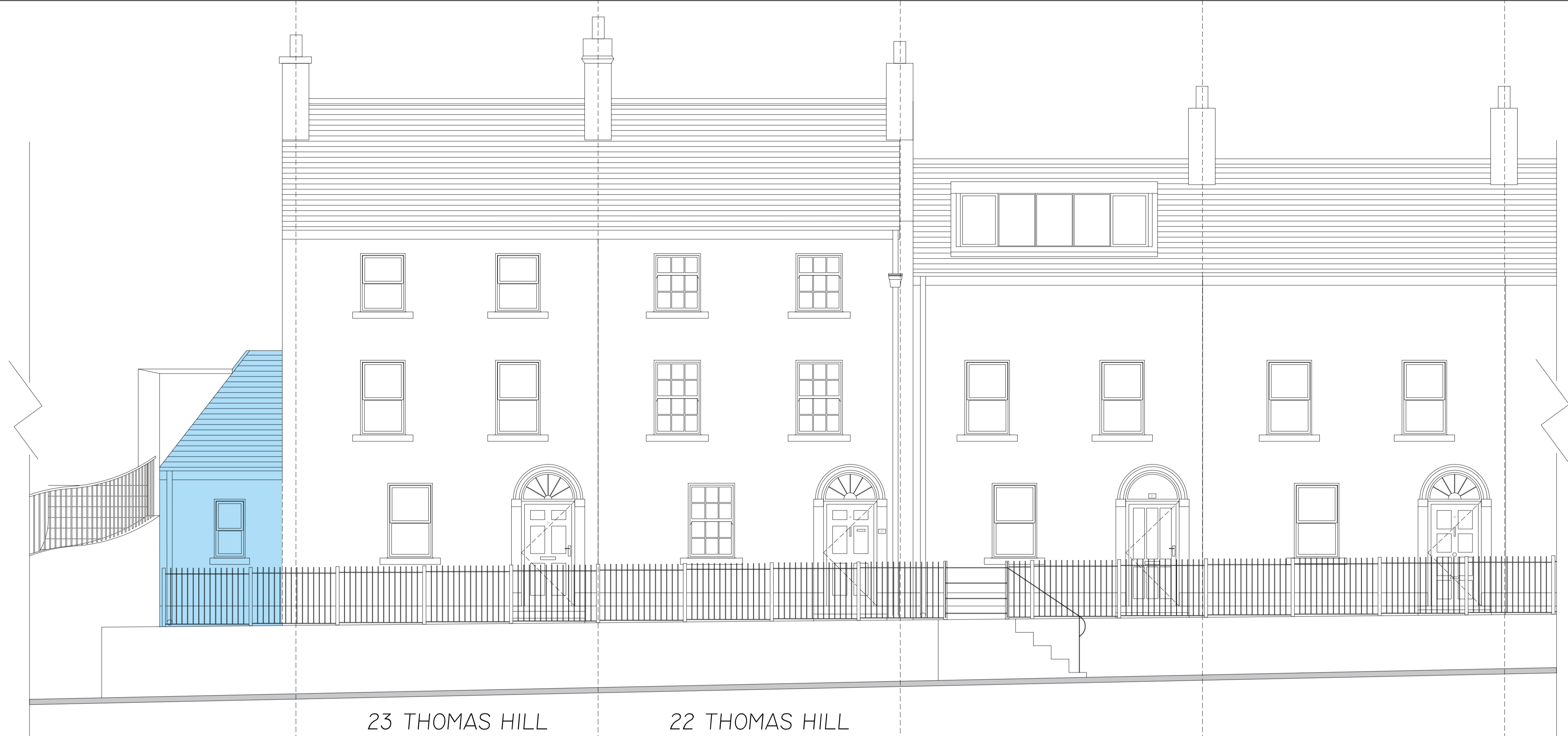
EXISTING THOMAS HILL ELEVATION 1:100 @ A3 / 1:50 @ A1