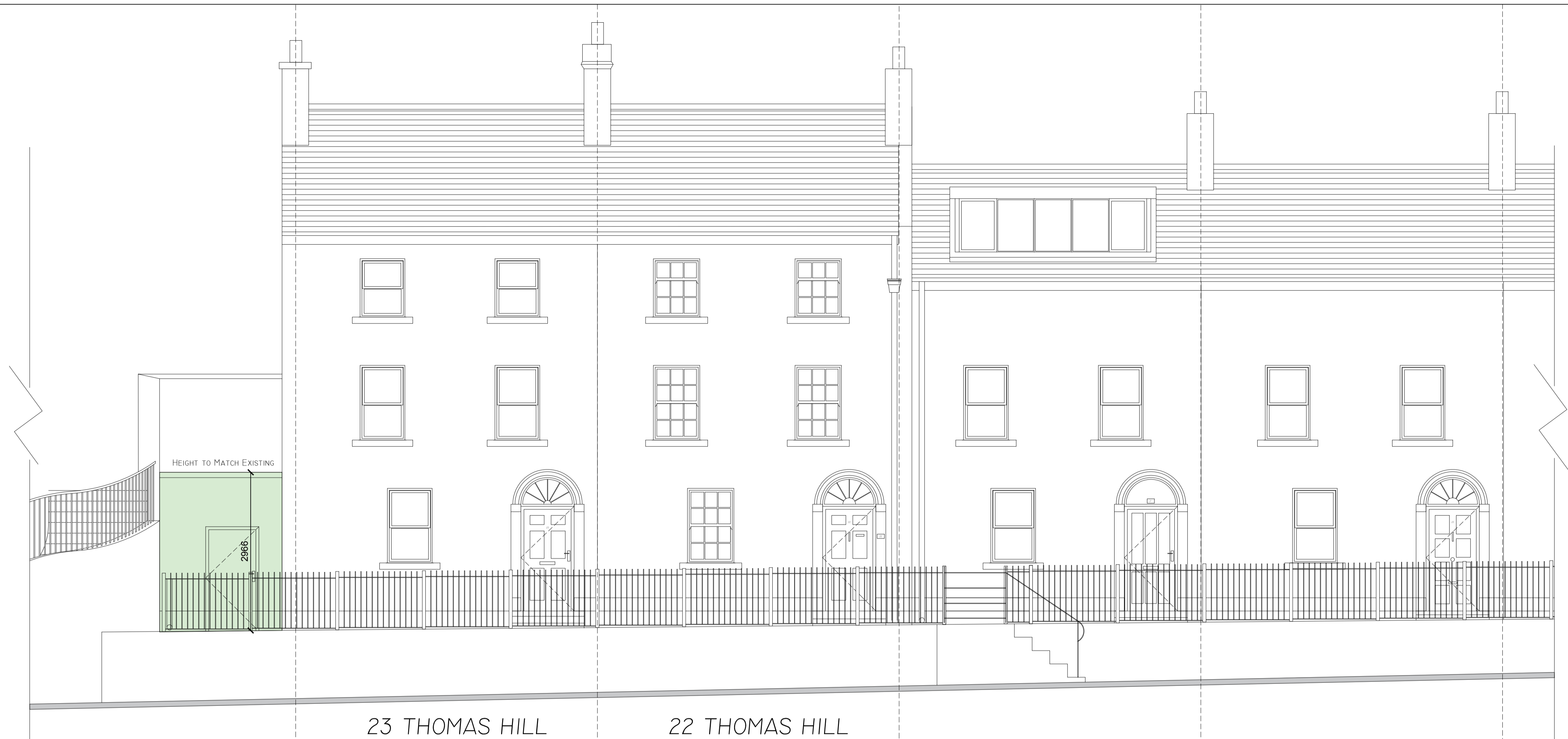
PROPOSED THOMAS HILL ELEVATION 1:100 @ A3 / 1:50 @ A1