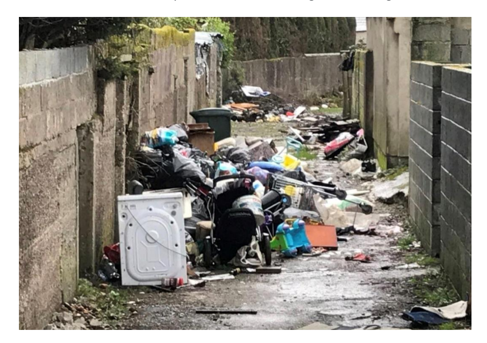
The waste was removed by Waterford City & County Council and the area is currently being monitored.

Environmental Enforcement Officers are currently carrying out investigations relating to the illegal dumping of 3.5 tonnes of household waste on a laneway at the rear of Cathal Brugha Place, Dungarvan.