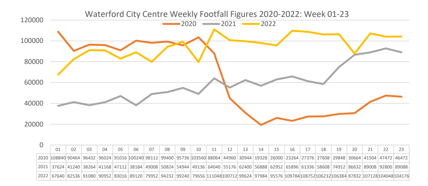
Note: In May 2021, there was a phased re-opening of non-essential retail and by 15<sup>th</sup> May a full re-opening of all retail. On May 10<sup>th</sup>, inter country travel was allowed.