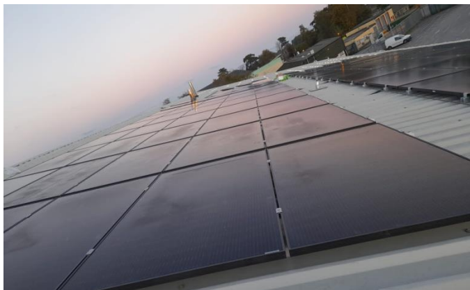
Solar photovoltaic panels installed at Waterford City & County Council, Dungarvan Depot.