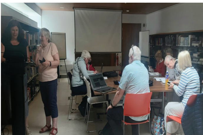
Closing the Digital Divide - Digital Connectivity Smartphone and Internet Classes in The Reference Room with the WWETB and supported by Central Library Staff.