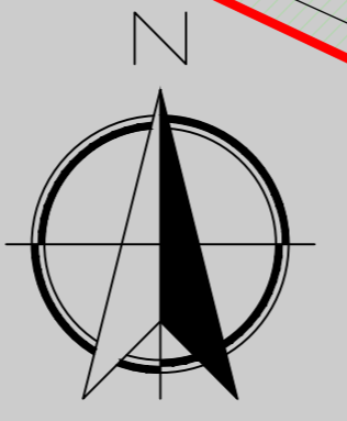
Site Layout Plan Scale 1:500 @ A0 O.S. Map Ref No. - 5700-A, 5700-B, 5700-D