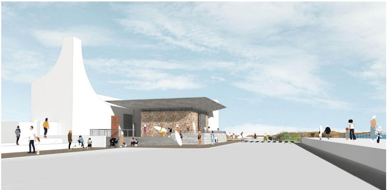
Artist's impression of the proposed Water Activity Centre