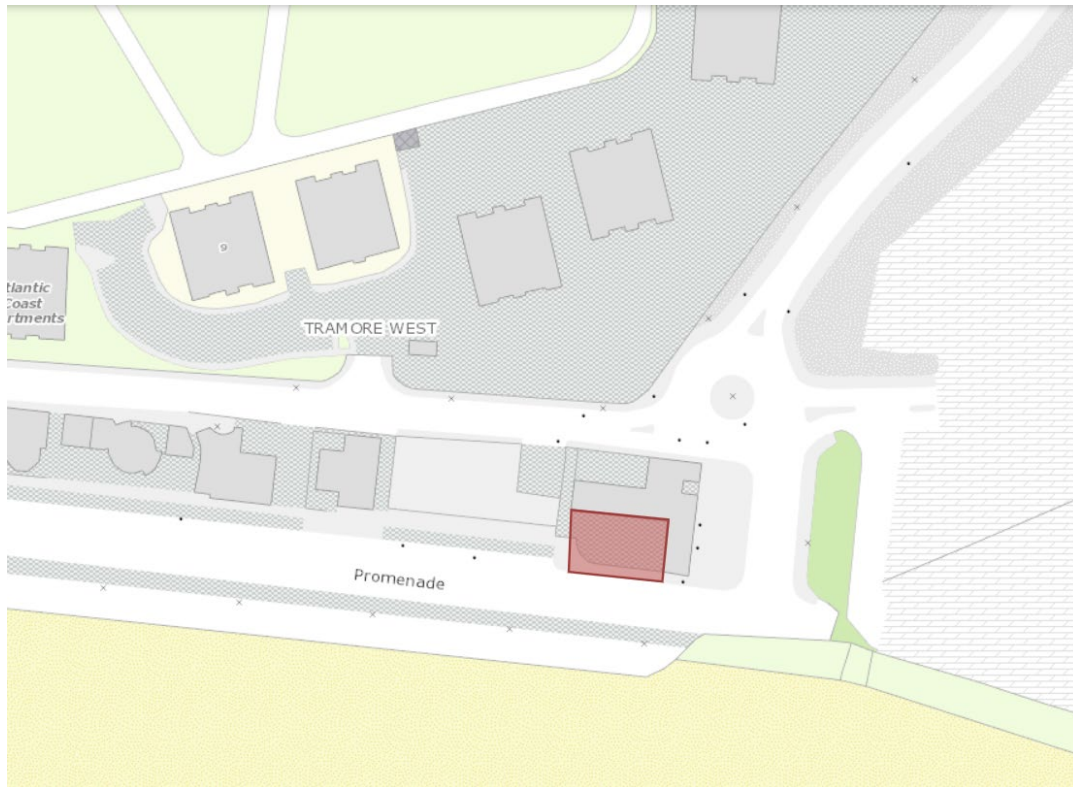
Fig.1: OSI Map of Site Location and Red Line Boundary.