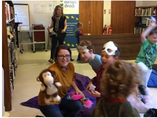
Culture Night – Comic & Puppet Workshop in Central Library