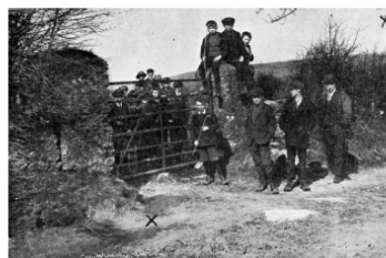
Burgery Ambush Site, c1921.

Waterford City and County Council are looking for your help to map the locations of War of Independence events throughout Waterford City and County. The locations identified will be mapped and made available online on an interactive did Story Map with supporting information and images about the events.