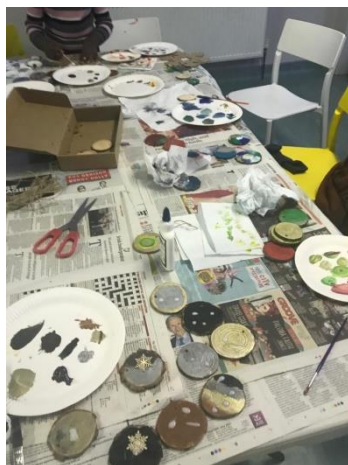
Photo of Christmas Crafts via Zoom with students in DP centre.