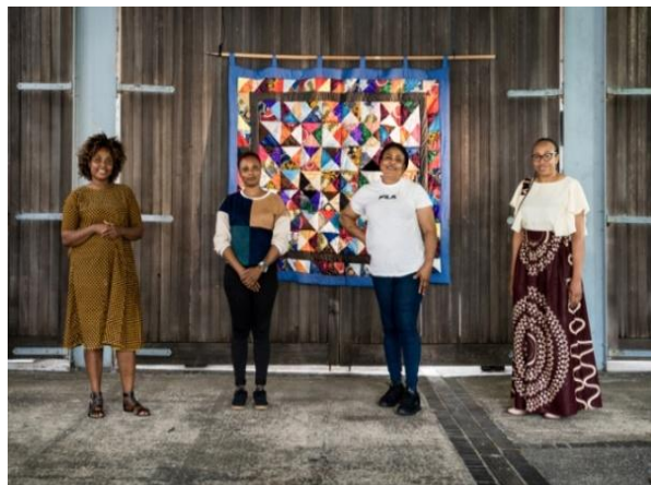
Pictured: Women of the Shakti Group displaying their quilt created for the Creative Waterford funded 'Diverse Creatives' Exhibition at Central Library