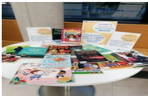
Pictured: Book and information display to support Dyslexia Awareness Month in Carrickphierish Library