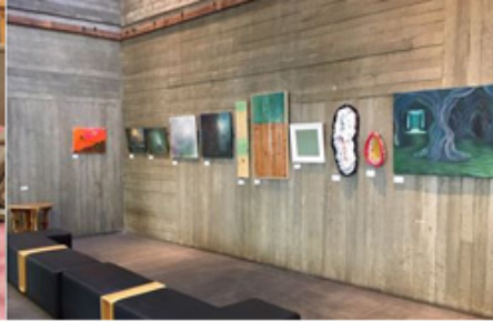
First Fortnight Tea with Clay