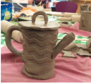
First Fortnight Tea with Clay