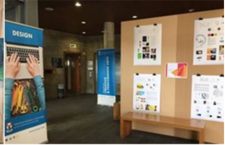
Hub Design Event Central Library