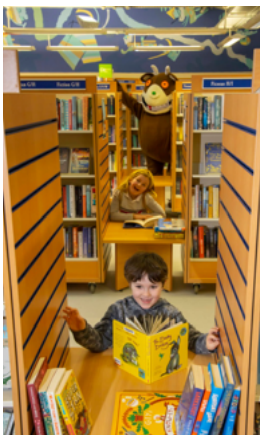
Valentine's Day in Dungarvan Library

with photos of the intergenerational Choir at the Index gallery Central library.