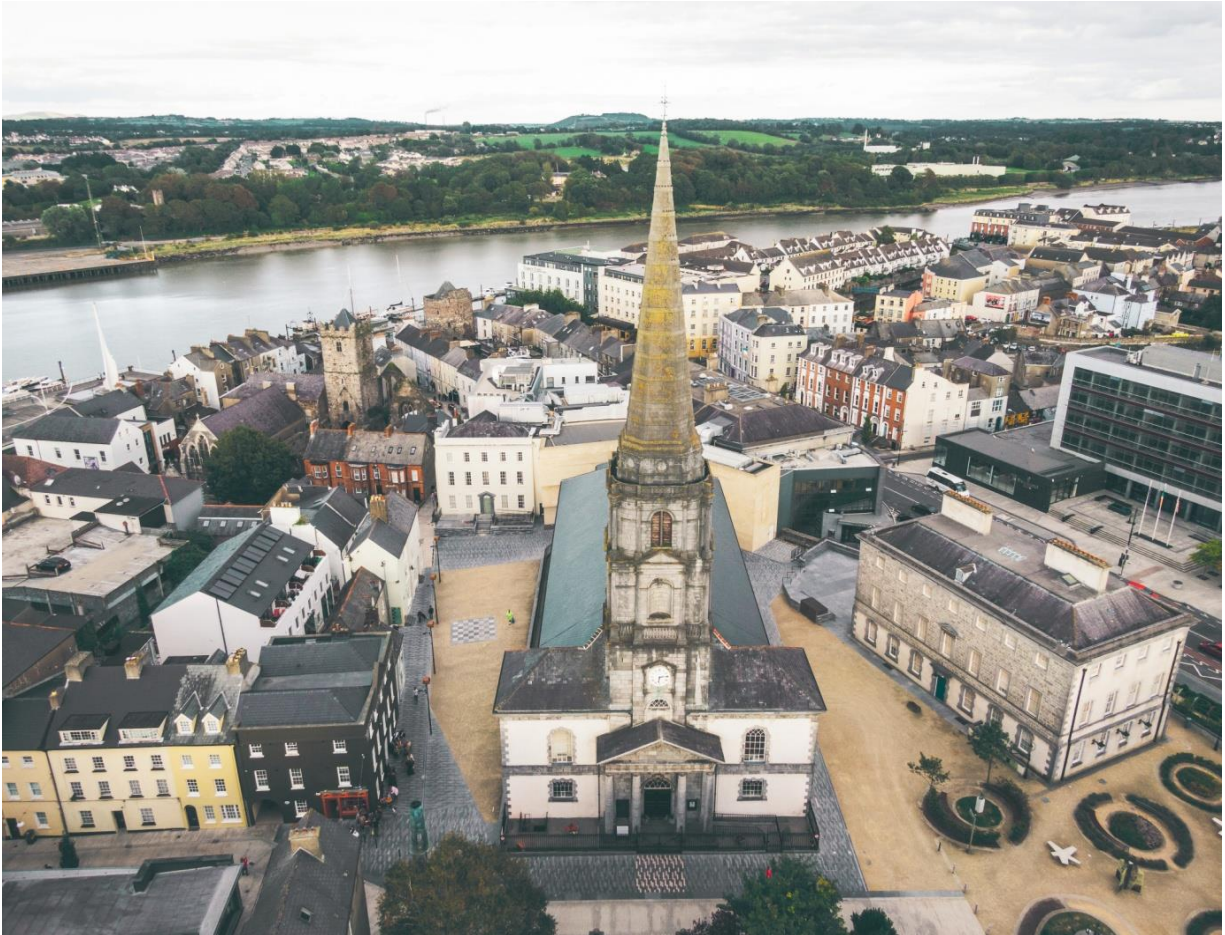
Waterford ranked as Ireland's Only Clean City - IBAL