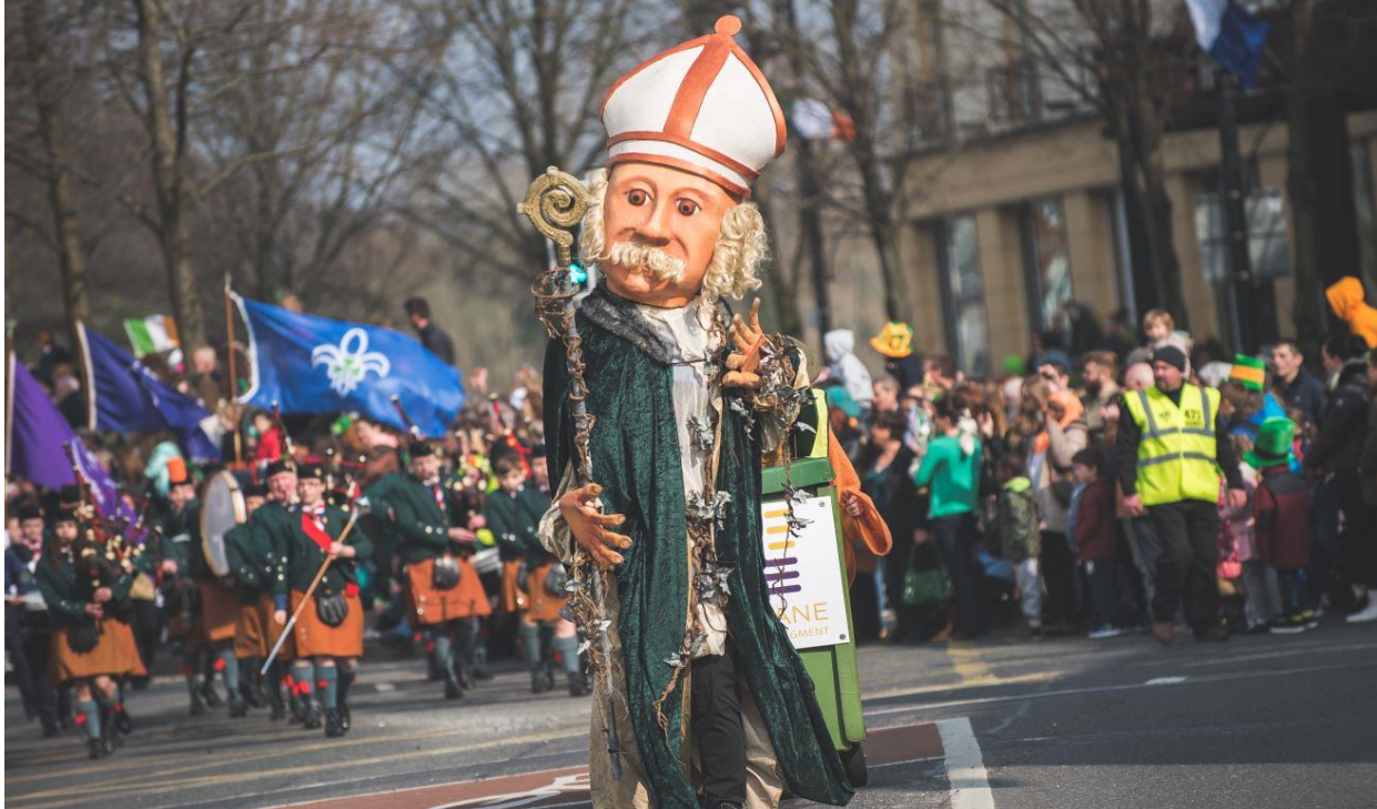
Waterford set for St. Patrick's Day Celebrations

https://www.rte.ie/news/regional/2022/0128/1276477-saint-patricks-day/