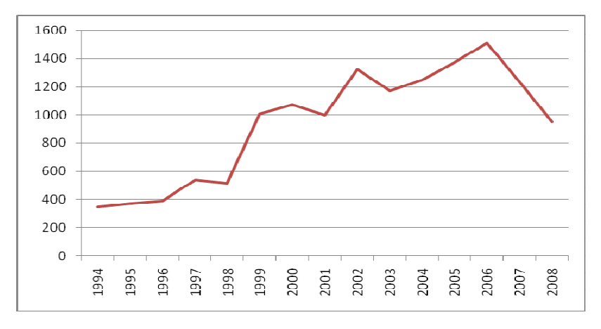
Figure 1: Housing Completions in County Waterford

Table 6 shows very clearly the housing bubble in Ireland since 1999, which graphed in Figure 1 below: