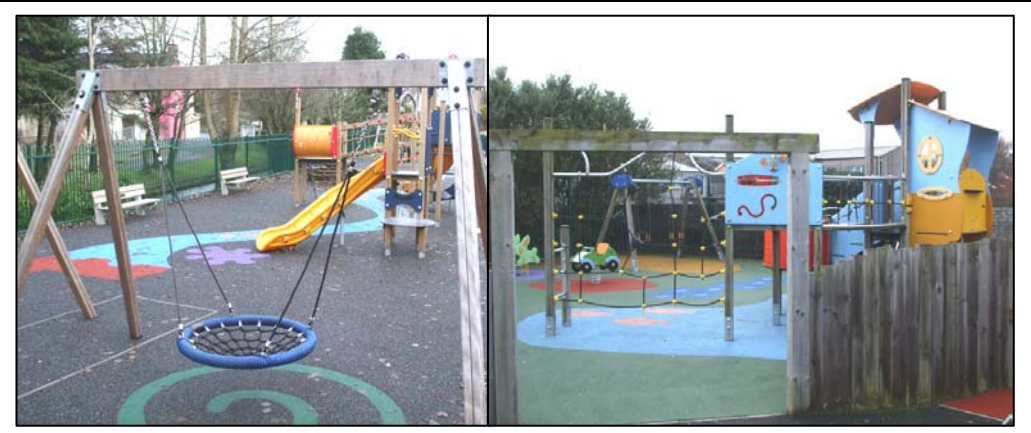
Playgrounds in the County