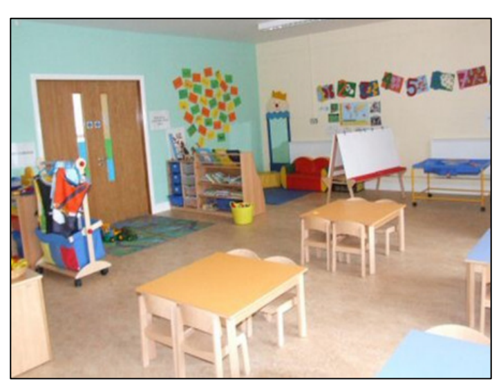
Cappoquin Community Centre Childcare Facilities

Investment Programme (NCIP). The Childcare Committees vision statement is "to develop а quality childcare environment where all children in County Waterford have opportunities of holistic development". This vision is to be achieved with direct co-operation with key stakeholders. Childcare is taken to mean full access to day care and sessional facilities for pre-school children and school going children out of hours.