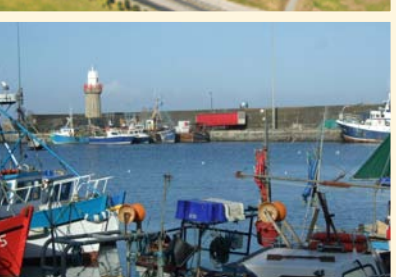
Volume 1 - Written Statement