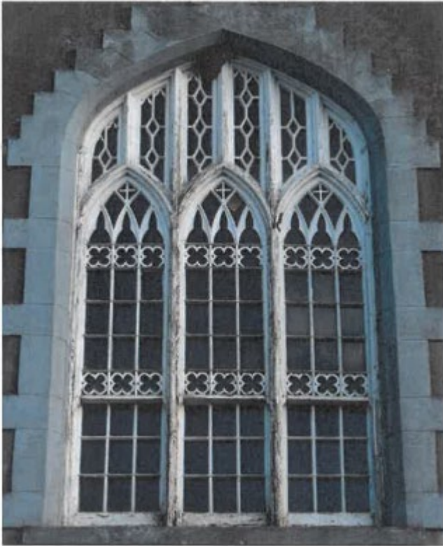
Before works to main frame

Photo of St Annes Church, Fewes window which is receiving BHIS funding;