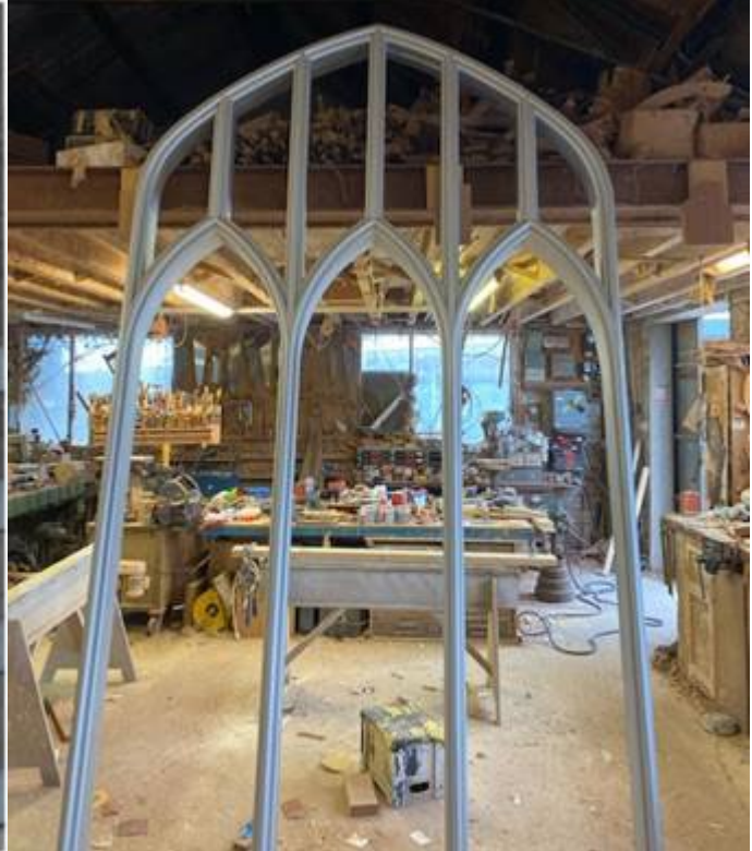
After Frame repaired and painted