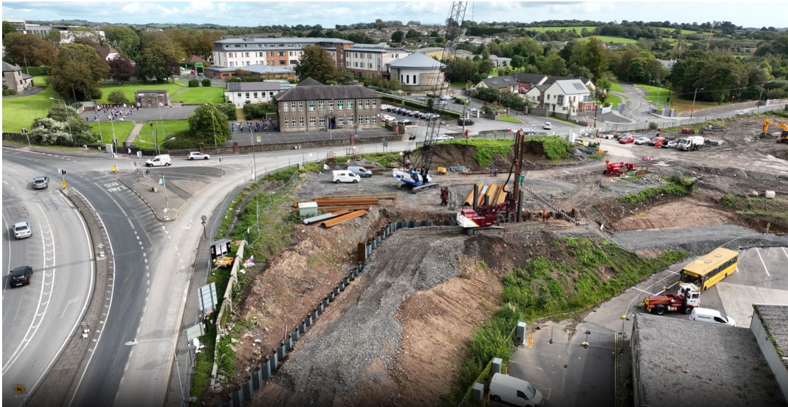
Sheet piling to the rear of the Bus Eireann Site