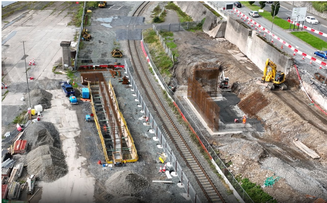
Bridge abutments for vehicular bridge, opposite the Ard Ri entrance

Traffic management measures are in place along Dock Road and operating well. A new road surface and paving are being installed in the current works area and the same process, installing sewer and surface water network services followed by resurfacing and paving will then progress to the next section of Dock Road and accompanied by associated traffic management measures.