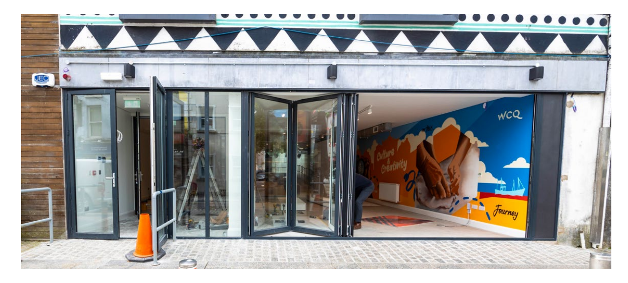
16-18 Barker Place (Project L) – works substantially complete

Barker Place, O'Connell Street (Project L), works are substantially complete to fit out the ground floor as a community and cultural hub and licence agreements currently being established with tenant.