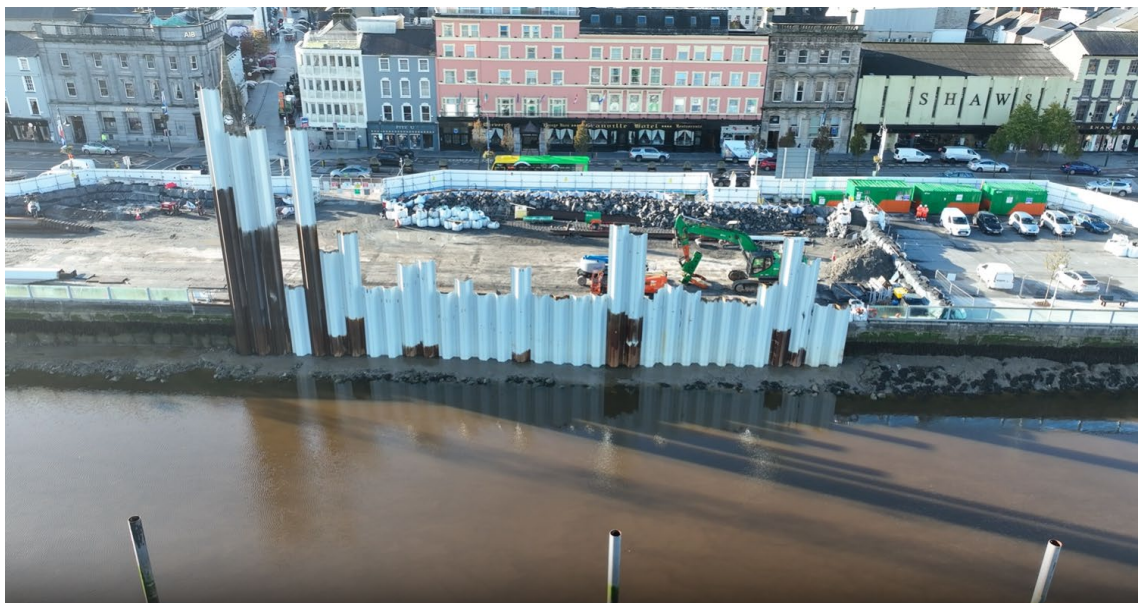
Sheet piling commenced at the Quay Wall on the South Plaza.