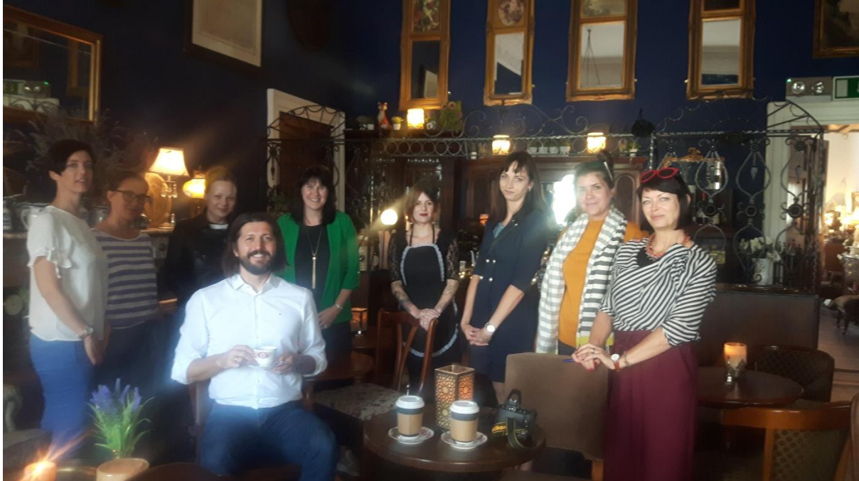
Creative Spirits Internship delegates visit Waterford 4 th to 6 th September

negative externalities and to promote a genuine solution to complex urban problems. The delegates also attended a “walkshop”; a guided tour of Loulé’s supports for creative industries such as sustainable design, traditional crafts such as the copper industry, pottery and artists.