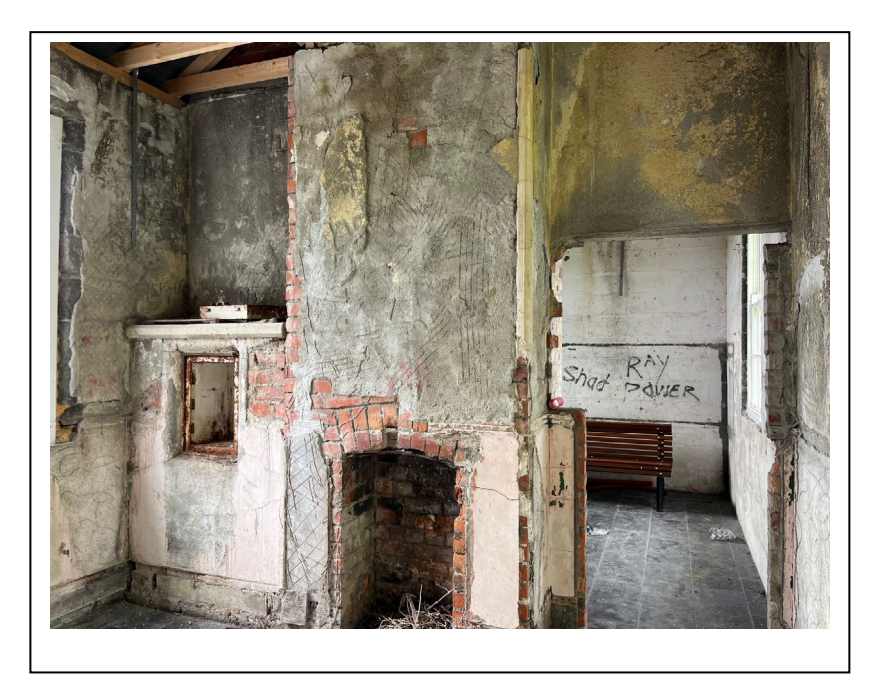
Fig 13 Internal Partition wall beside fireplace to be removed

Fig 14 Fireplace with safebox and opening either side.