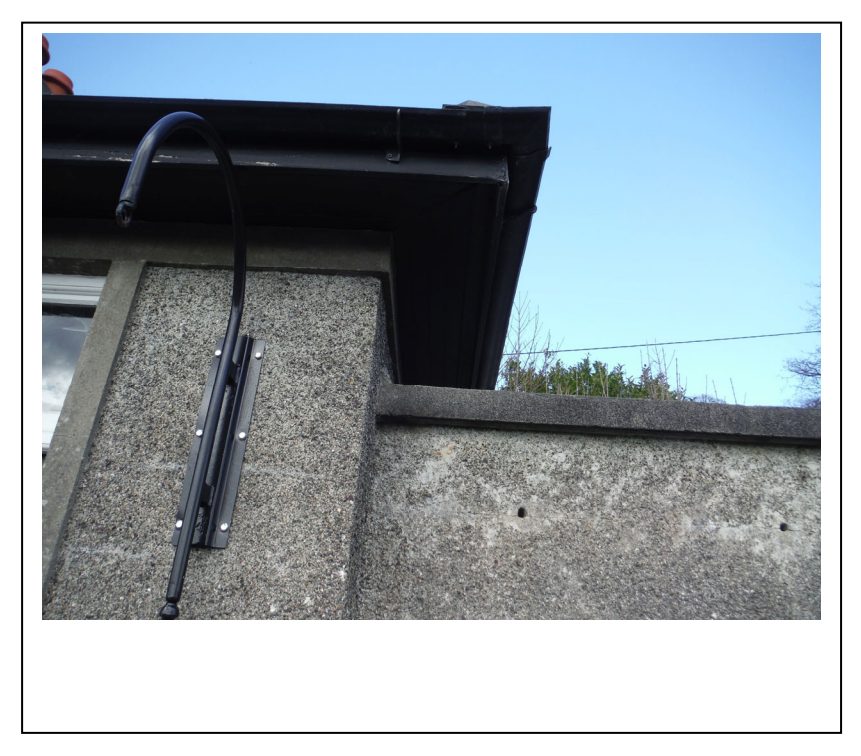
Fig 9 New renovation Eaves with Timber facia soffit and new metal Gutter