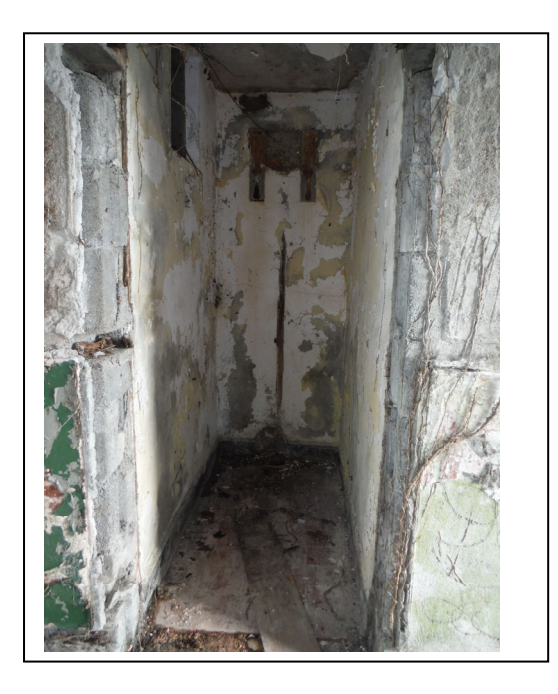
Fig 17 WC Recess in ladies Toilet