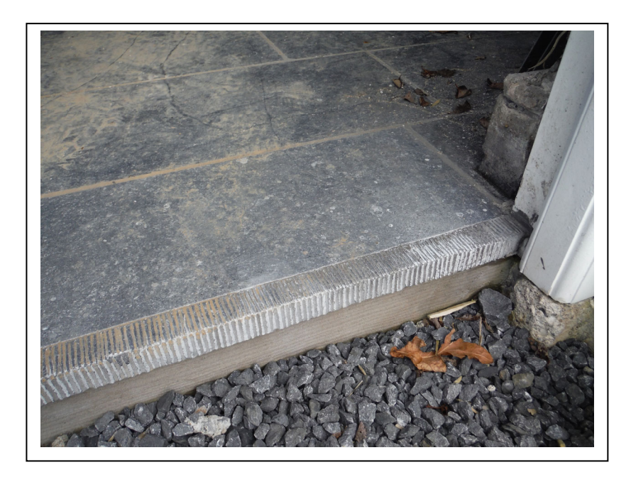
Fig 19 New Limestone Floor