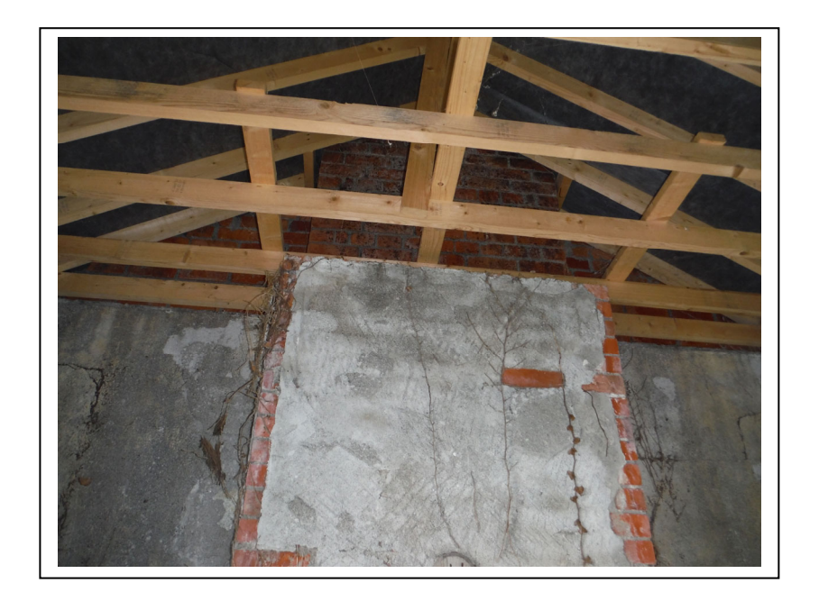
Fig 18 New Roof structure