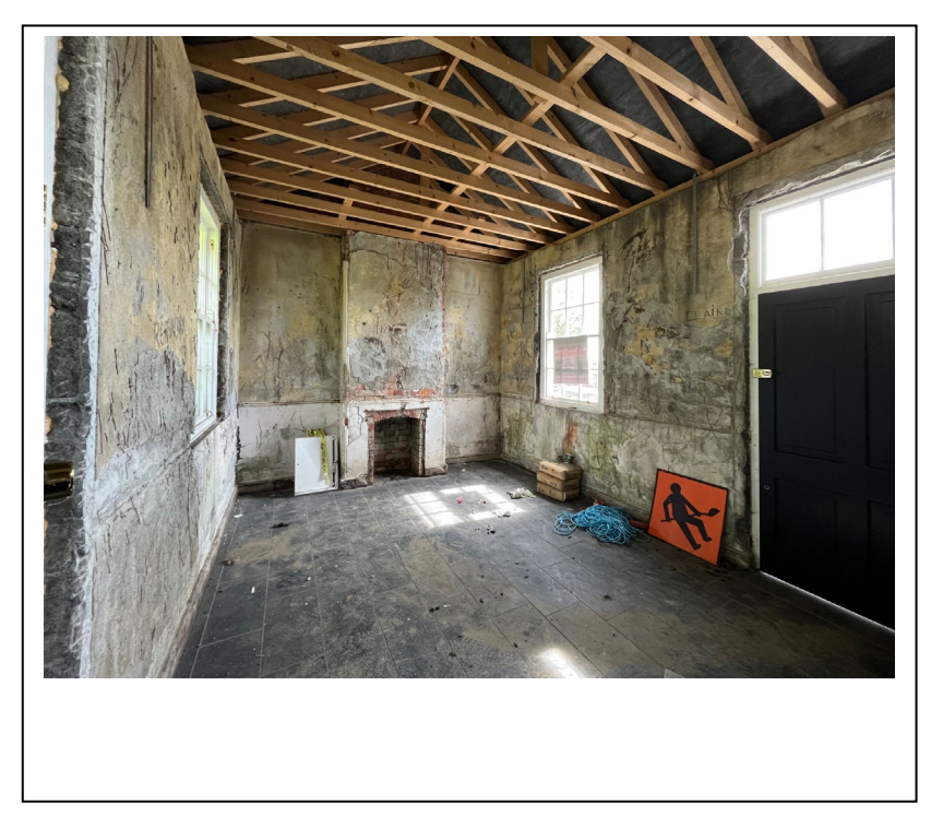
Fig 10 Interior 1

Fig 9 New renovation Eaves with Timber facia soffit and new metal Gutter