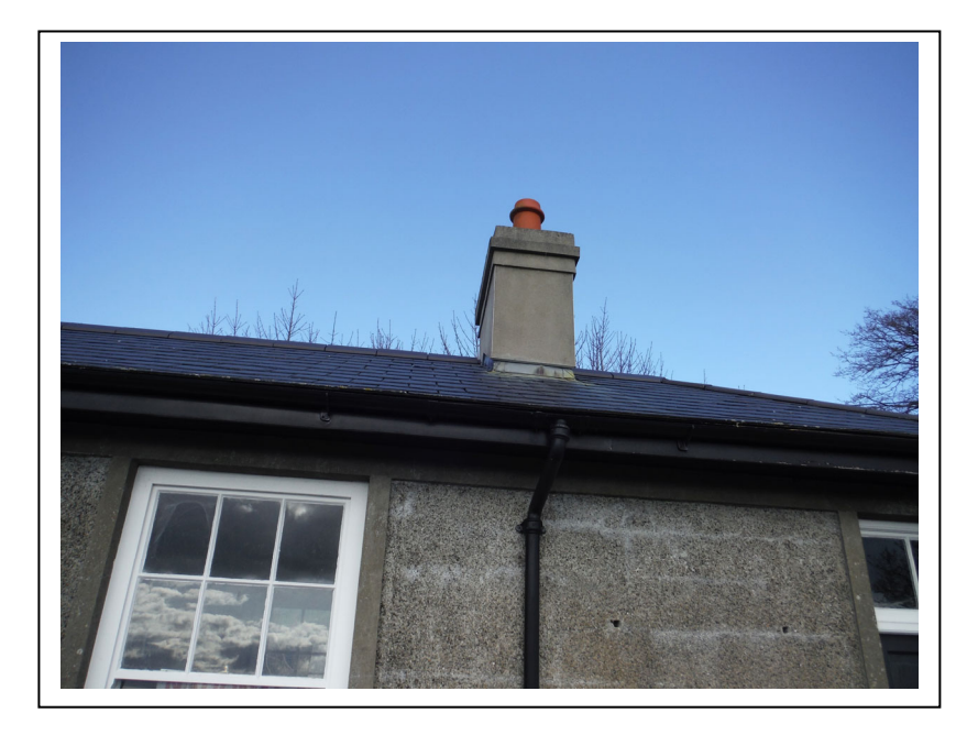
Fig 5 Side elevation of train station with gent's toilets