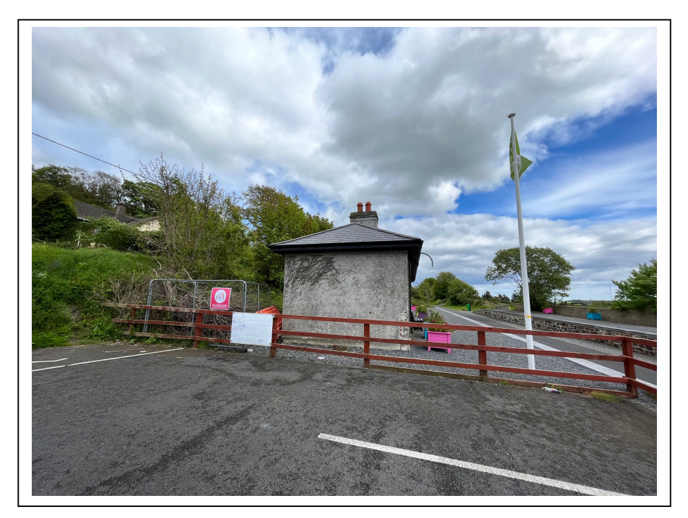
Fig 3 Rear Elevation from Road