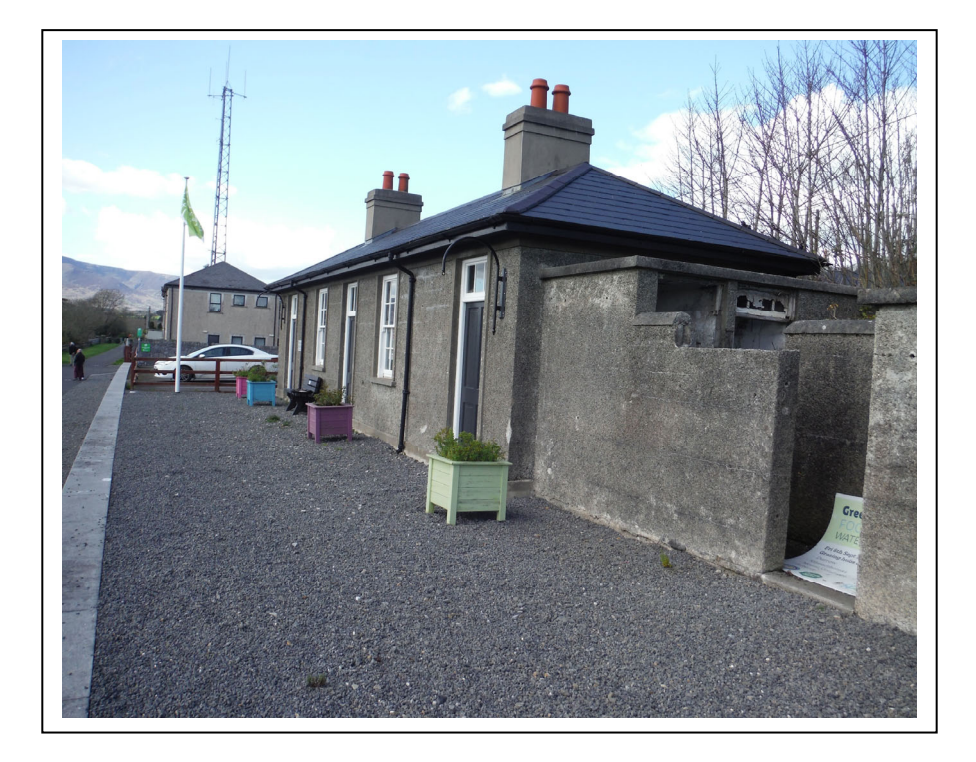
Fig 2 Front Elevation 2