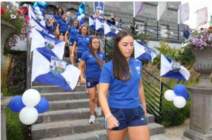
Homecoming for Waterford Senior Camógie All-Ireland finalists