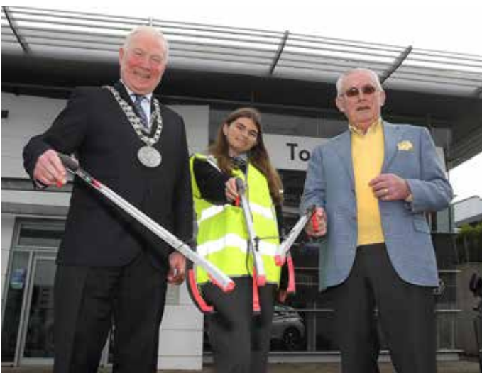
Schools Litter Challenge 2023