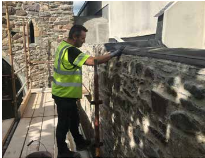
Building conservation works