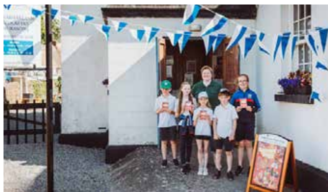
Summer Stars reading challenge in Dunmore East Library

2023 was another busy year for Local Studies in Waterford Libraries. With a variety of events, talks and workshops taking place throughout the year in various locations.