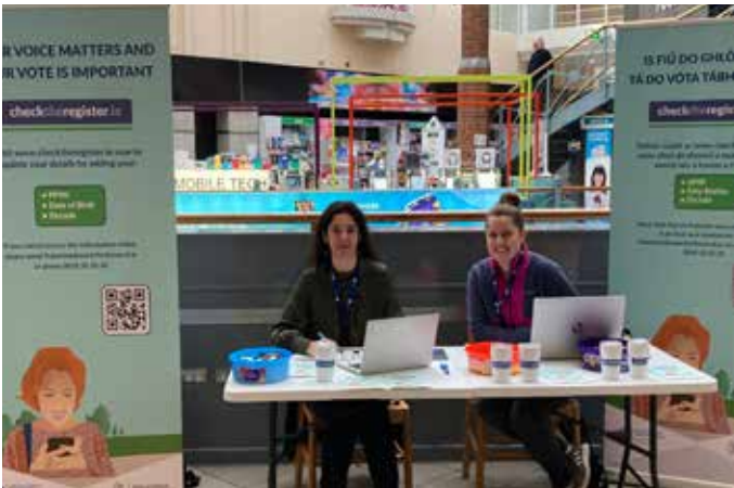
Check My Register Roadshow