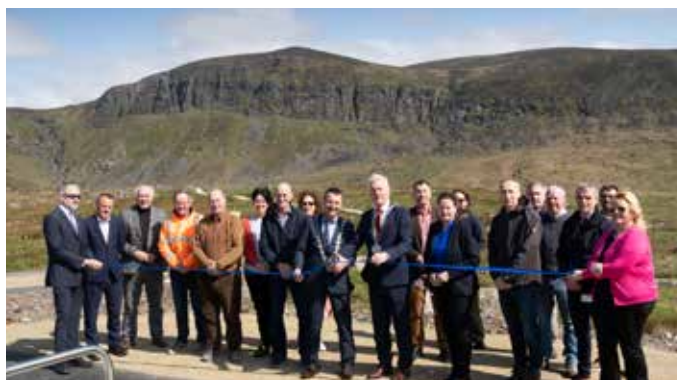
Official opening of the newly extended Mahon Falls Car Park

Rural Economic Development staff support the work of local communities and trail development groups all across Waterford in monitoring, maintaining, managing and promoting the ever-growing number of recreational trail across Waterford.