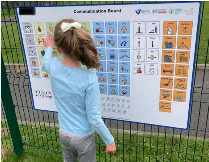
Communications Boards installed in various parks