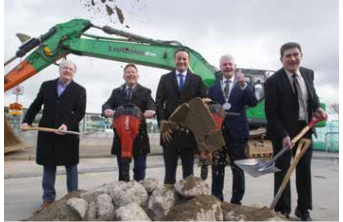
Breaking ground at the North Quays Public Infrastructure Project