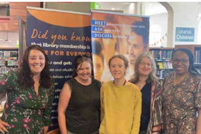
Clothes Swap Event at the Central Library