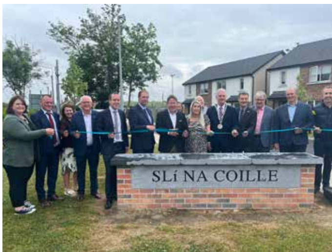
Meeting with residents of Slí na Coille, Tramore