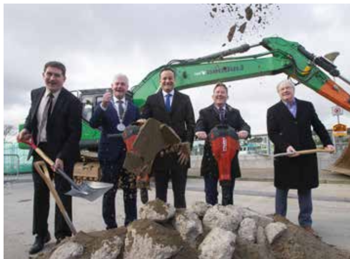
Breaking ground at the North Quays Public Infrastructure Project