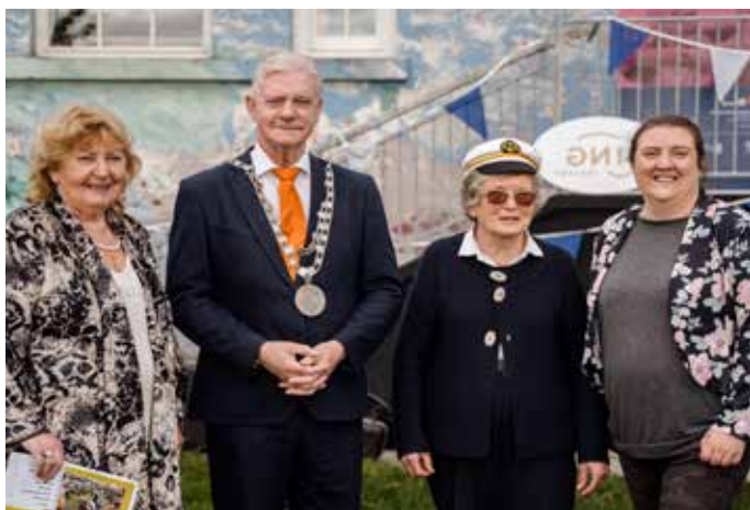
The Bealtaine Dawn Chorus

The Council is made up of 32 elected representatives spread across 6 electoral areas with the Mayor elected by the members annually. Along with the Corporate Policy Group (CPG), 5 Strategic Policy Committees (SPC) develop and recommend policy to the Council. Committees are made up of the business, farming, environment, community, and trade union sectors.