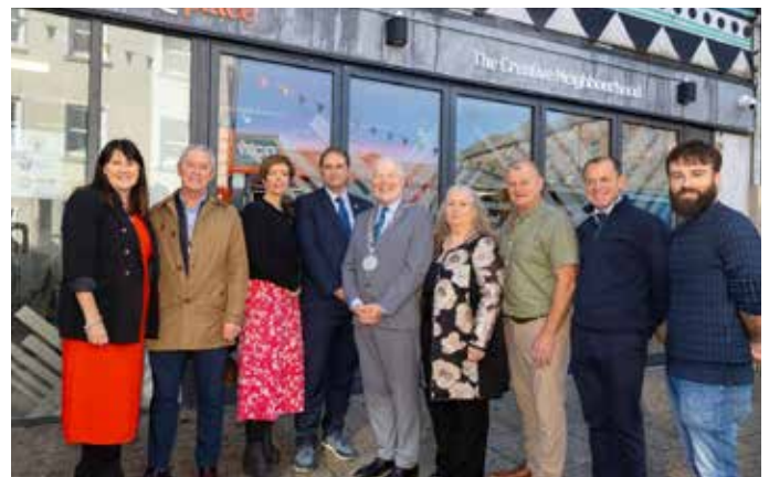
Opening of the WCQ Place, Community and Cultural Hub

The Projects Team in collaboration with other Council Sections completed several projects over the past twelve months. The Irish Wake Museum was opened at No. 3, 4 & 5 Cathedral Square, conserving, and successfully repurposing some of the oldest domestic buildings in Ireland. Tramore Library was successfully refurbished receiving the highest maintenance grant allocation nationally. Delivering a modern repurposed facility to accommodate the new open library model. Works to the library completes the first phase of the Tramore Town Centre Regeneration Project.