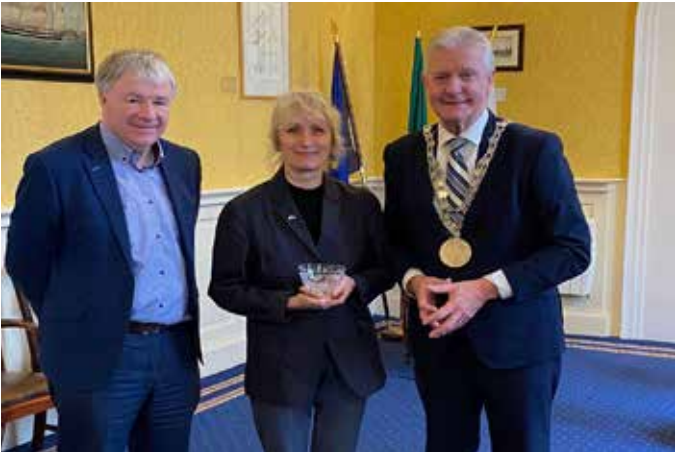
Estonian Ambassador visiting City Hall