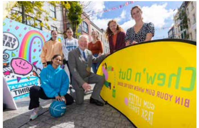
Gum Litter awareness campaign