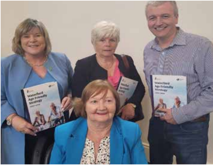
Age-Friendly Strategy Launched