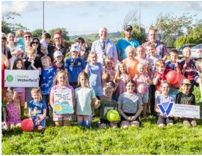
Healthy Waterford Playful Streets