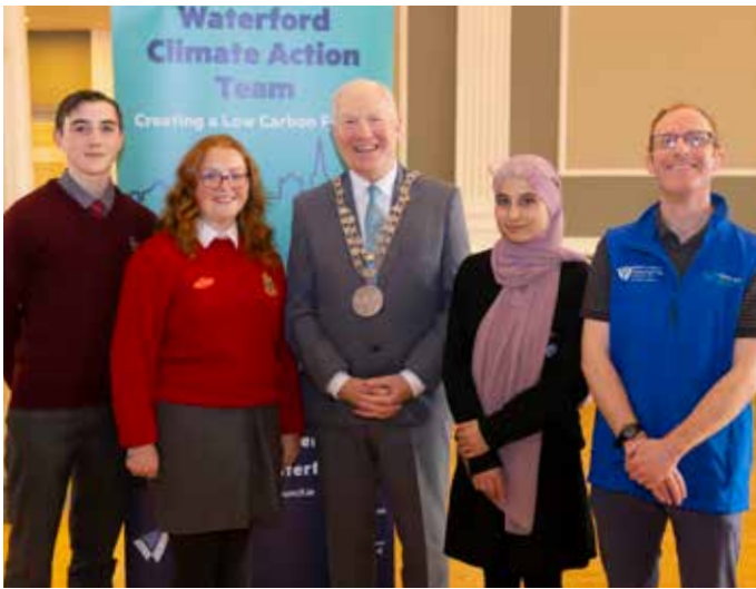
Climate Change Plan Roadshow