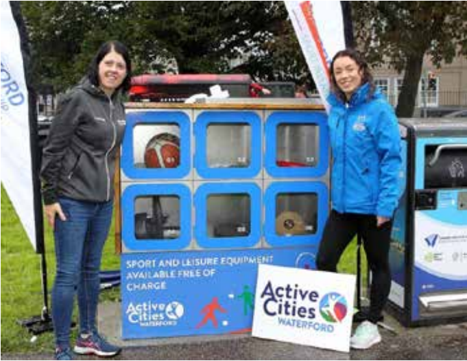
BoxUp at People's Park