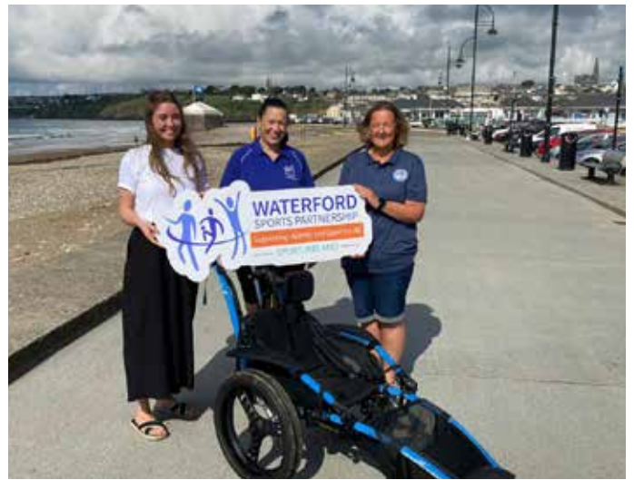
Beach Wheelchair Launch in Tramore