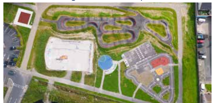
New BMX Pump Track at Fairlane Park, Dungarvan