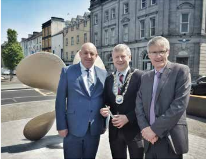
SS Port Láirge propeller unveiled as monument