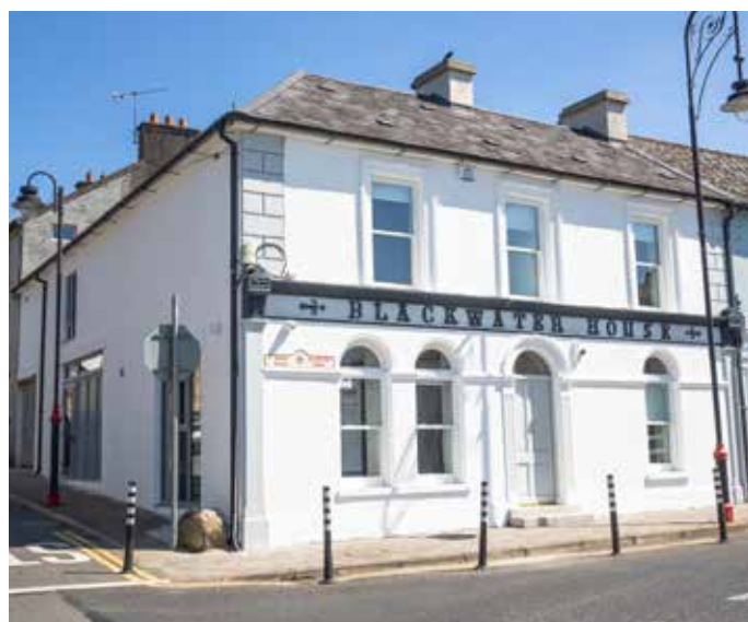
Blackwater House, Cappoquin after refurb