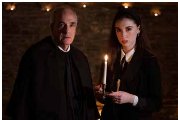
The Irish Wake Museum

In addition, the Waterford Local Enterprise Office (LEO) team played a pivotal role in helping businesses to move to online trading during the year. They also continued to provide valuable resources online, by phone and in person.