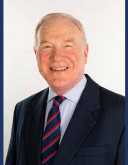
Cllr. Joe Conway Mayor of Waterford City & County

Waterford continues to be a place of welcoming people with a strong sense of community, and I look forward to seeing what 2024 brings for us.