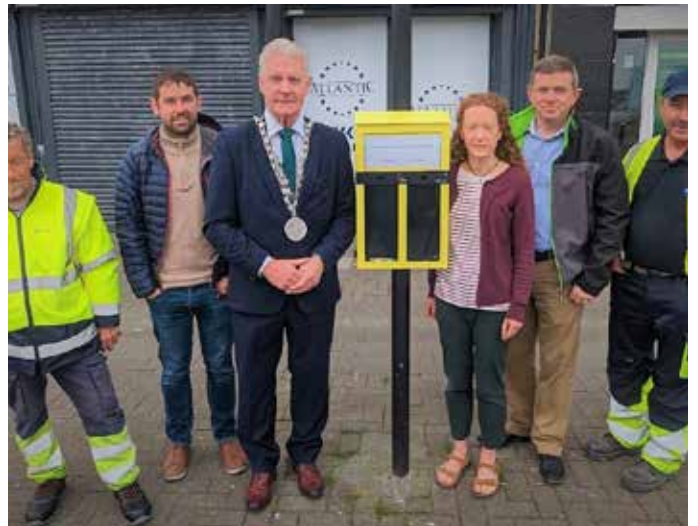
Ballot Bins installed in Tramore and Dungarvan