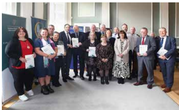
Community Safety Plan Launch

During 2023 significant work and consultation continued on the Waterford Age Friendly Alliance Strategy 2023 – 2028 which was officially launched by Minister Mary Butler TD. In delivering this strategy, the Waterford Age Friendly Alliance will ensure that the City and County continues to have an age-friendly approach to policies, programmes, services, and infrastructure relating to the physical and the social environment, enabling older people to live in security, good health and continue to participate in society in a meaningful way.