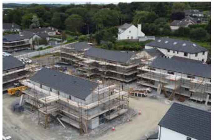
Gort na hInse housing development