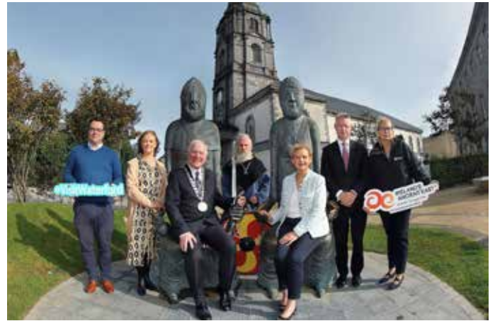
Successful conclusion of Destination Town