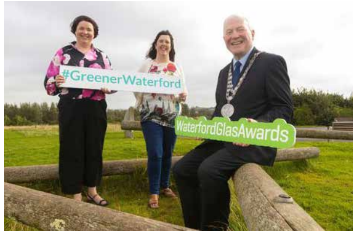
Waterford Glas Awards Launch