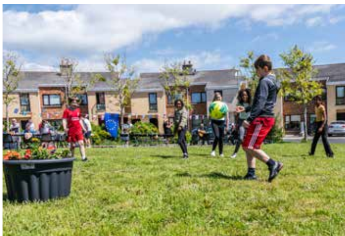
An Garrán rin Tramore named as runner-up at the All-Island IPB Pride of Place awards

Once again Waterford emerged as Ireland's Cleanest City in the Irish Business Against Litter (IBAL) Anti-Litter League. The city ranked 13th out of 40 cities and towns and was classed as Clean to European norms. Waterford City continues to score very well in the IBAL litter league. Seventeen out of the twenty-four sites surveyed got the top litter grade and there were no litter blackspots.