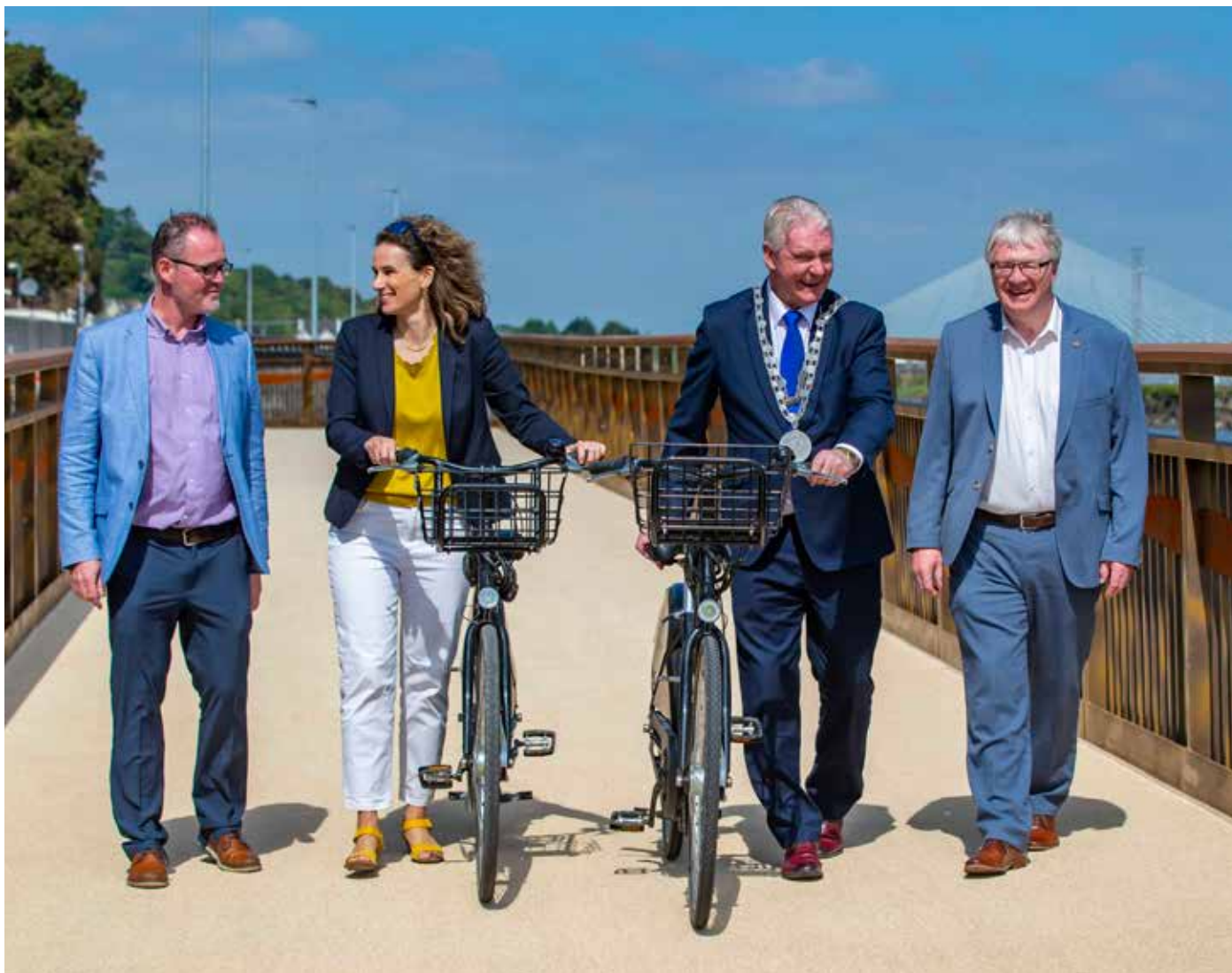
The official opening of the Bilberry to City Centre Waterford Greenway extension