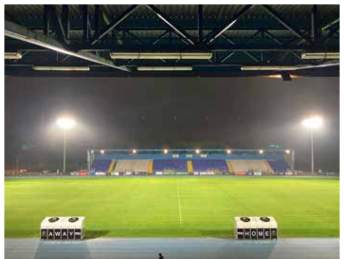
Floodlights installed at the RSC