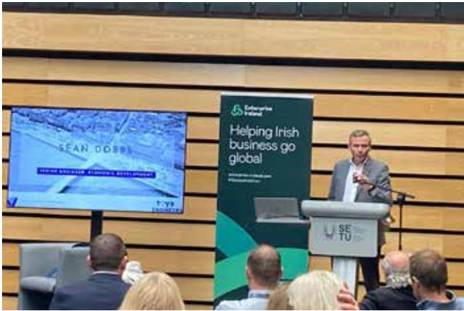
North Quays presentations at Toys4Engineers