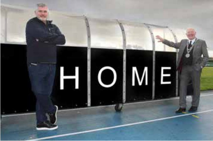
Waterford FC & Waterford City & County Council sign 50-year contract for the use of Regional Sports Centre