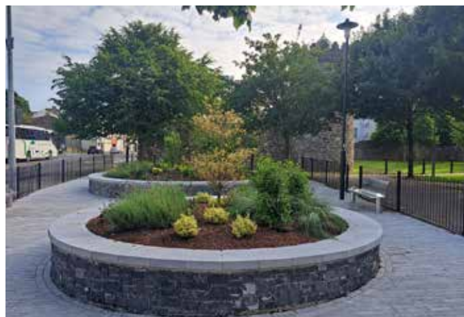
Railway Square improvement works