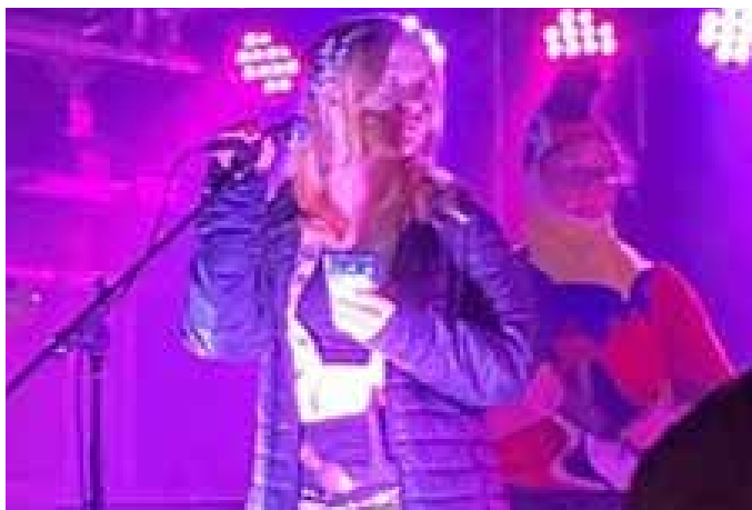
Washed Out in concert in Dungarvan