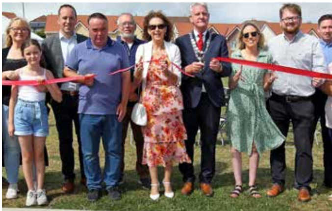
Mount William estate officially opened

2023 also saw the continuation of the partnership and collaborative approach to homelessness with all agencies working together and focusing on homeless prevention, tenancy sustainment and supported exits for homeless clients. Waterford Integrated Homeless Services received 3,392 callers seeking their services in 2023. 913 formal homeless assessments were carried out and a total of 72 families and 165 individuals were supported by WIHS to move into permanent accommodation and away from homelessness.