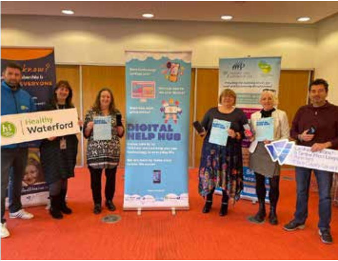
Digital Help Workshops