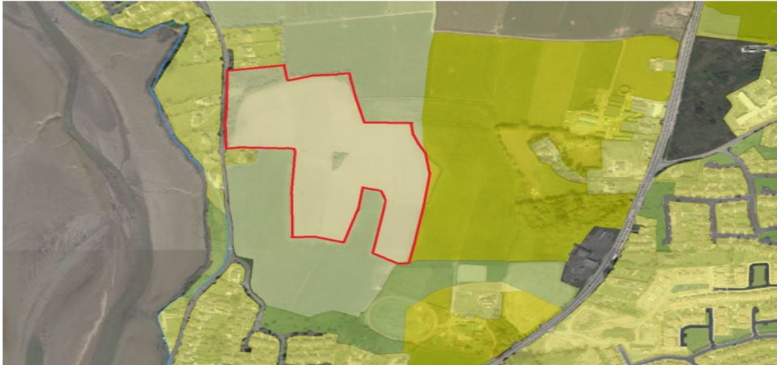
Lands at Monang, Dungarvan, Co. Waterford which are the subject of High Court Order made on the 10 th July 2024 (Ref: 2022 651 JR) all of which are now zoned for "New Residential Development" (GZT R1)

DGDO22: To secure the sustainable and sequential longer term development of lands at Monang, located between the Old Hospital Road and the N25, development of Tier 2 residential lands shall be informed by and consistent with a masterplan, the scope and detail of which shall be agreed in writing with the planning authority prior to the masterplan being prepared.