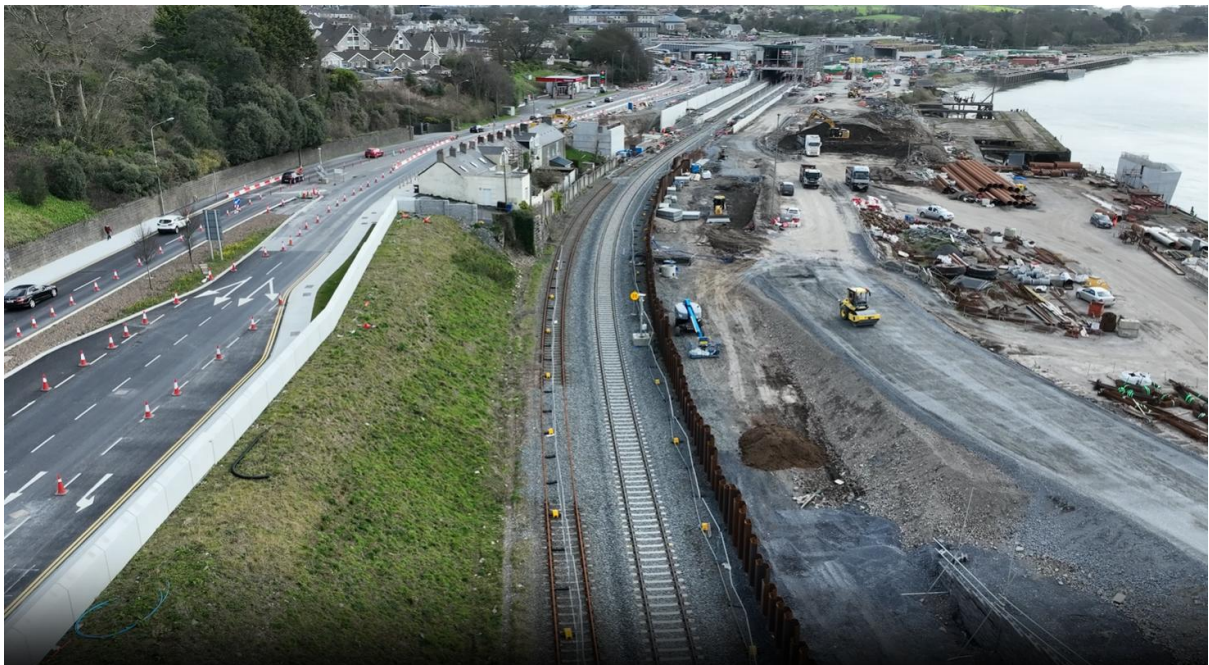
Flood defence sheet piles wall being put in place which links to flood defence system installed at the Train Station

Works are continuing on the train station building, platforms and internal layout, while the northern entrance and the planters that bound the external stairs are emerging and now visible. A decision on the Part 8 planning application for the southern entrance/access to the new train station is expected in April.