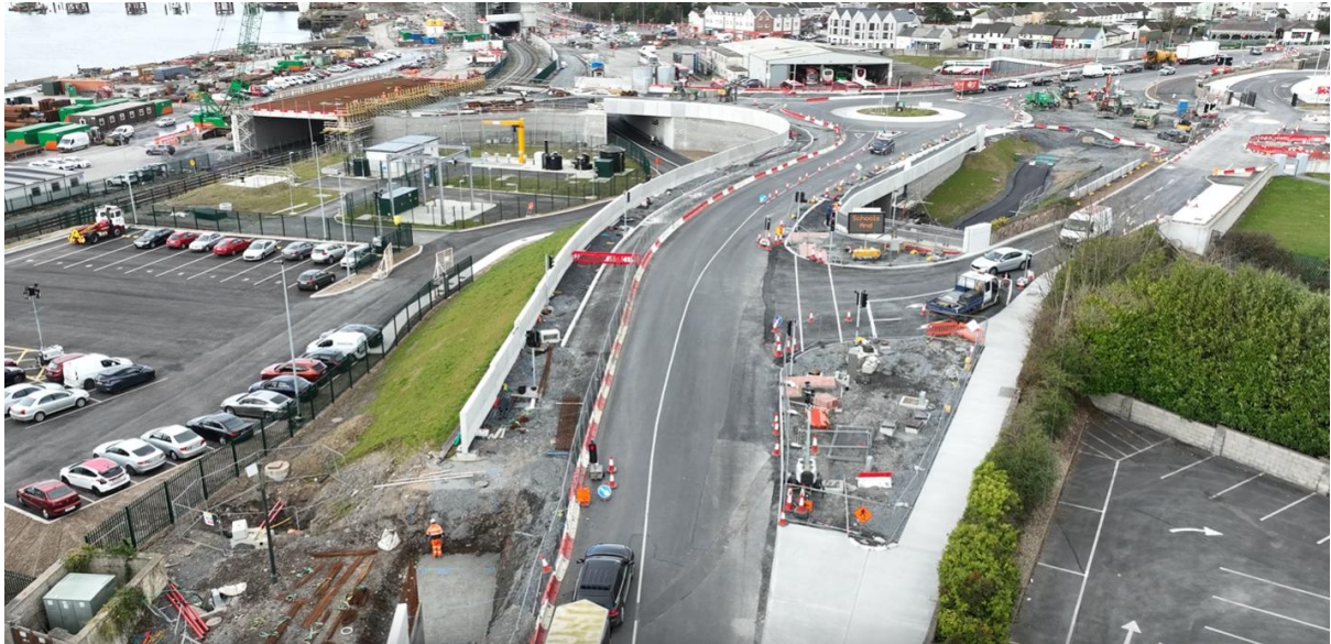
New link road to school and care facilities on Abbey Road is in operation

The final road surface has been laid on Fountain Street and extending to Abbey Road, with the provision of a greenway access link, drainage works and installation of services, footpaths, lighting, signage, etc. Similar works are continuing on the inbound lane on Dock Road. It is expected that the new junction at the entrance to the Ard Ri / North Quays construction site will be operational in early April.