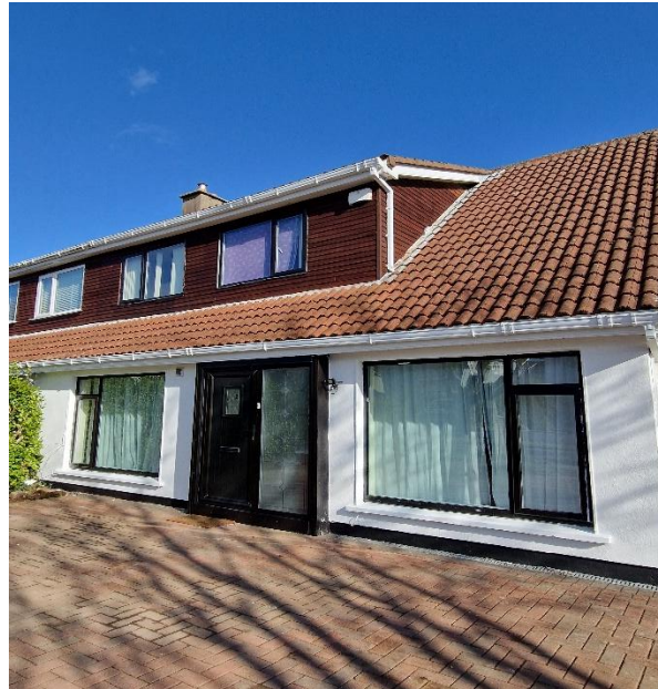
Front Elevation for 2 Aspen Close, Viewmount, Waterford After