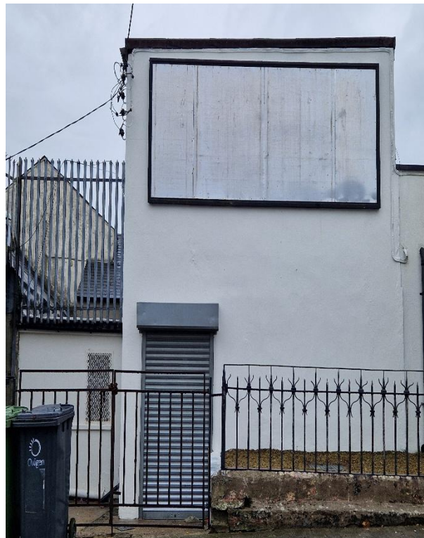
Front Elevation for Ozanam Street, Waterford After