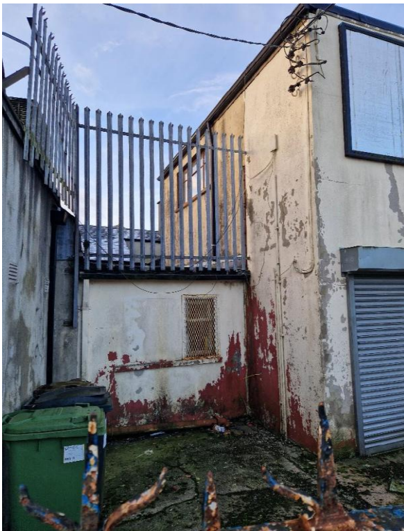
Front Elevation for Ozanam Street, Waterford Before

In March 2025, the derelict sites team successfully collaborated with property owners to remove several properties from dereliction, thereby alleviating their derelict status. At the time of writing this report, we have successfully closed a total of 82 cases. Please find the before and after images for your review.