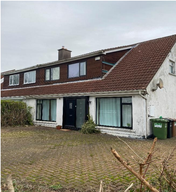
Front Elevation for 2 Aspen Close, Viewmount, Waterford Before