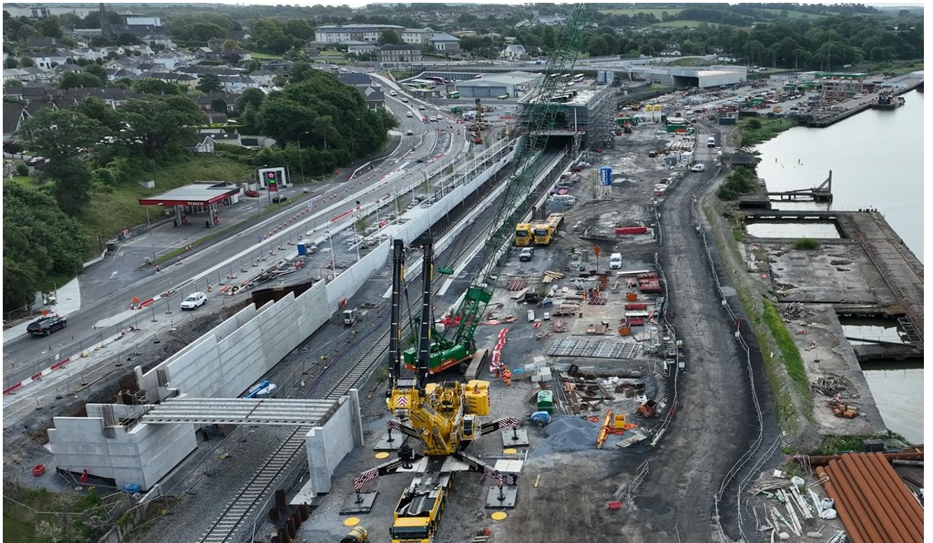
Deck beams installed on the western footbridge that links Dock Road with the Sustainable Transport Bridge. The platforms are substantially complete and paving works are ongoing at the bus drop off facility