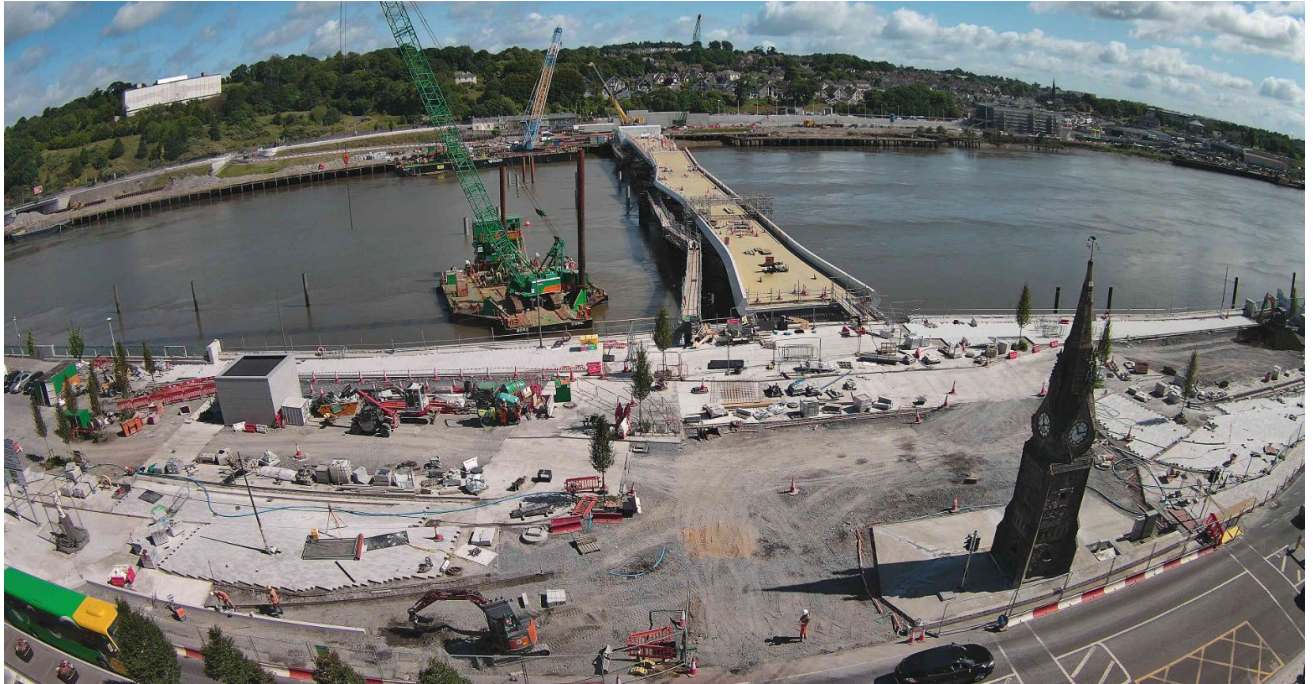
South Plaza with paving and landscaping works ongoing

The southern land point at the new South Plaza is also well advanced. Paving, bicycle parking and landscaping works are clearly visible within this new public realm facility, while the bus stop at Meagher's Quay / Clock Tower has been reinstated to its final position. Traffic Management measures have been transferred west of the Clock Tower to allow for utility and paving works in this area. A nighttime lane closures will take place on the South Quays from the 21 st to the 25 th July 2025. In advance of the works, traffic management details will be publicised on radio, to local stakeholders, on variable messaging signs and all WCCC social media channels