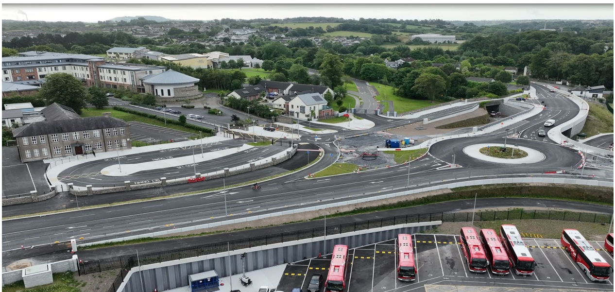
Abbey Road final wearing course complete and finishing out lighting, landscaping and greenway access

Road infrastructural works are progressing well with the final wearing course laid on Abbey Road. Traffic management remains in place in Fountain Street and Dock Road and these works are expected to be completed this summer.