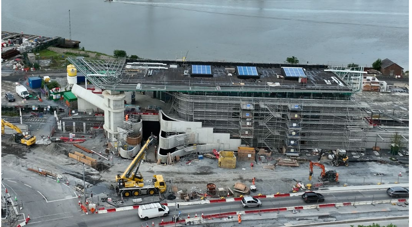
Transport hub with roof glazing and planters in situ that will frame the northern entrance steps

Works are continuing at the Transport hub, with glazing, internal fit out, the northern entrance and cladding progressing. The new drop of facility to the west of the station building is now emerging. It will provide set down, disabled and bicycle parking facilities as well as access to the new southeast Greenway.