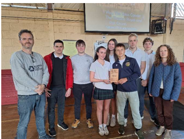
Rubbish film festival regional award being presented to Mercy Secondary school and Newtown secondary school.