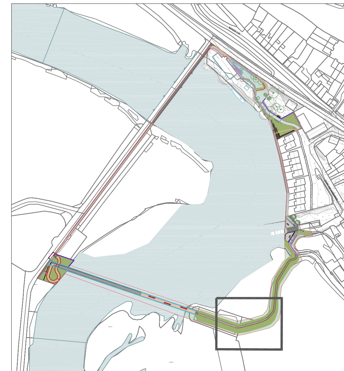
LOCATION PLAN (ROUTE-WIDE) 1:2500