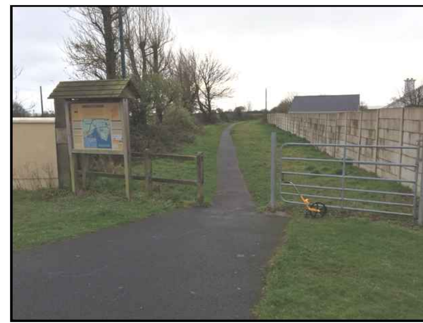
D Location of Site Notice Existing photo looking South Path to be widened to 2.5m along left side of photo