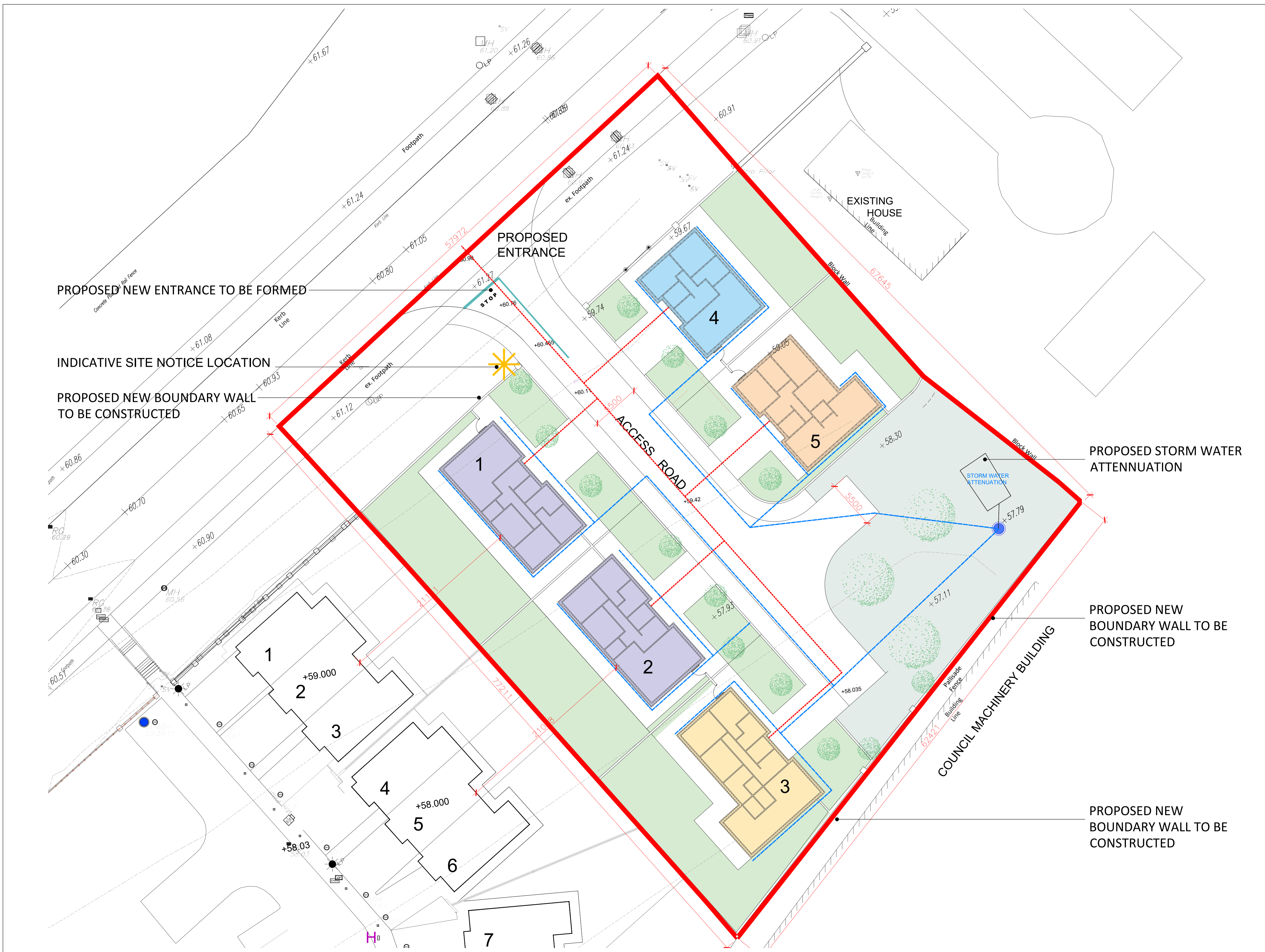
Proposed Site Layout 1:200 @ A1