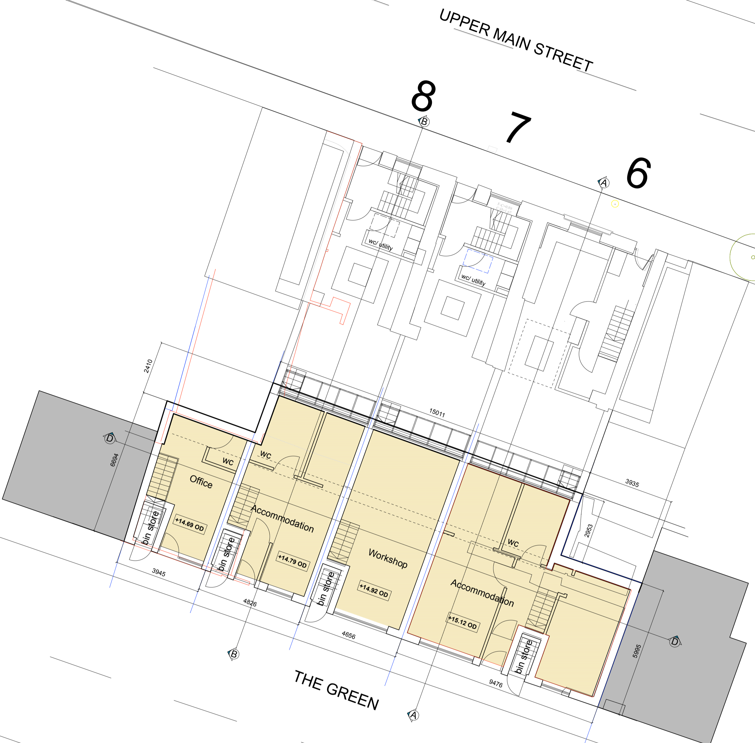
Ground Floor The Green