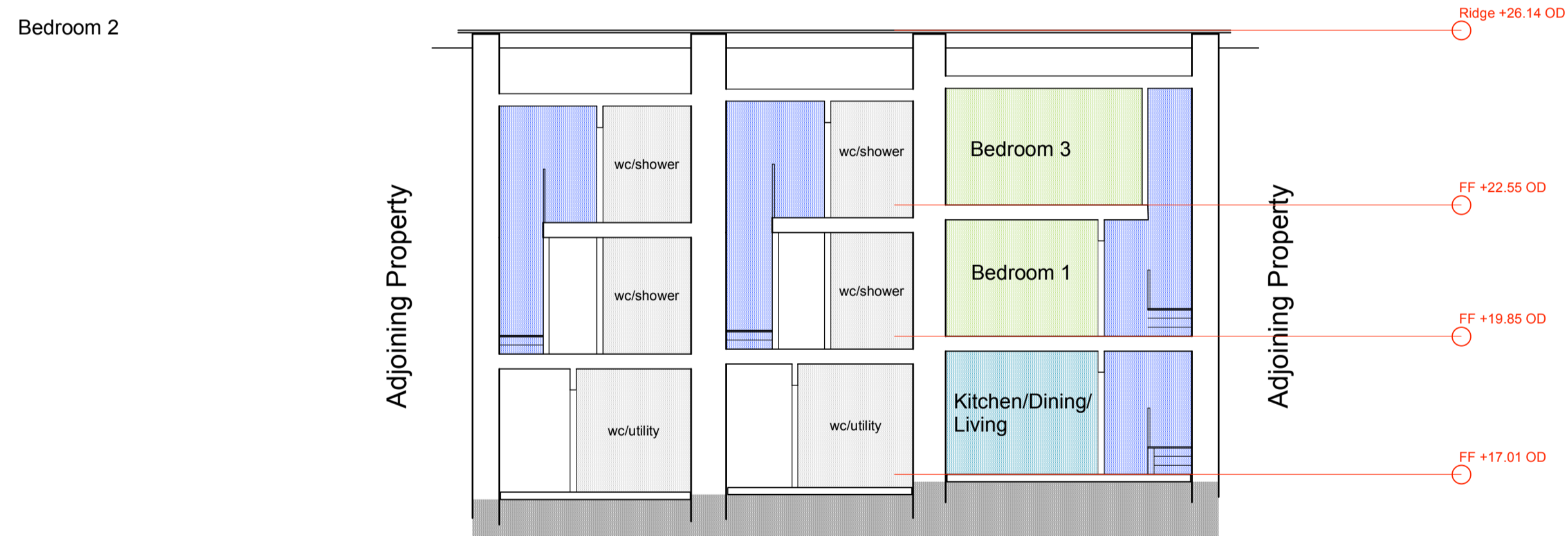
Section C-C Proposed