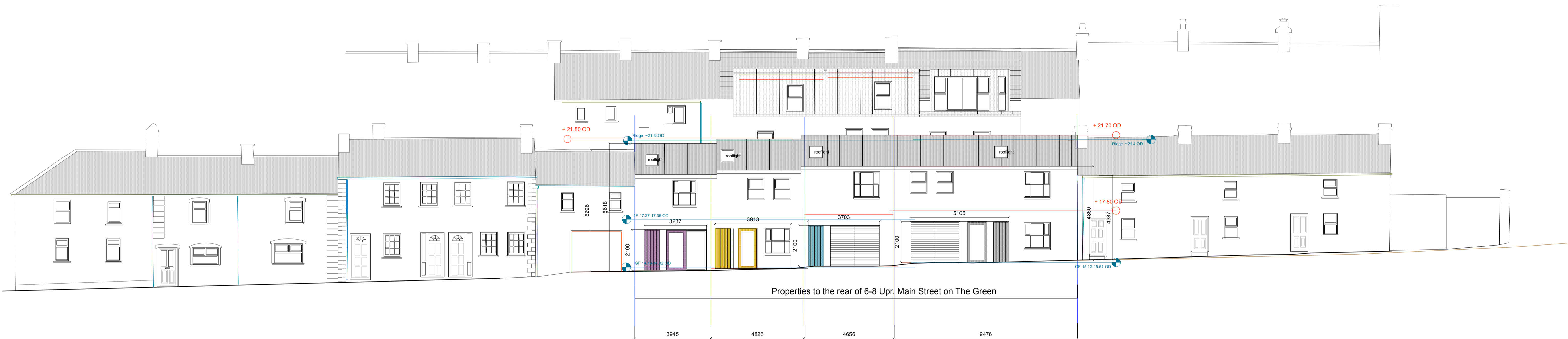
South Elevation to The Green