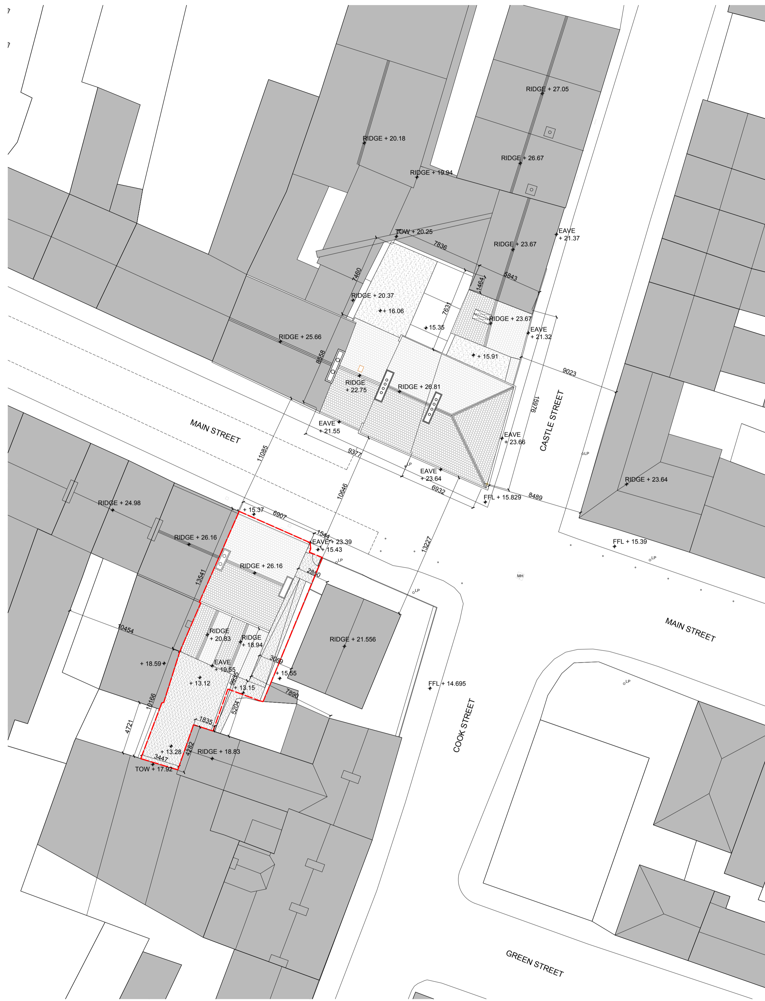
01 EXISTING SITE LAYOUT 1:200