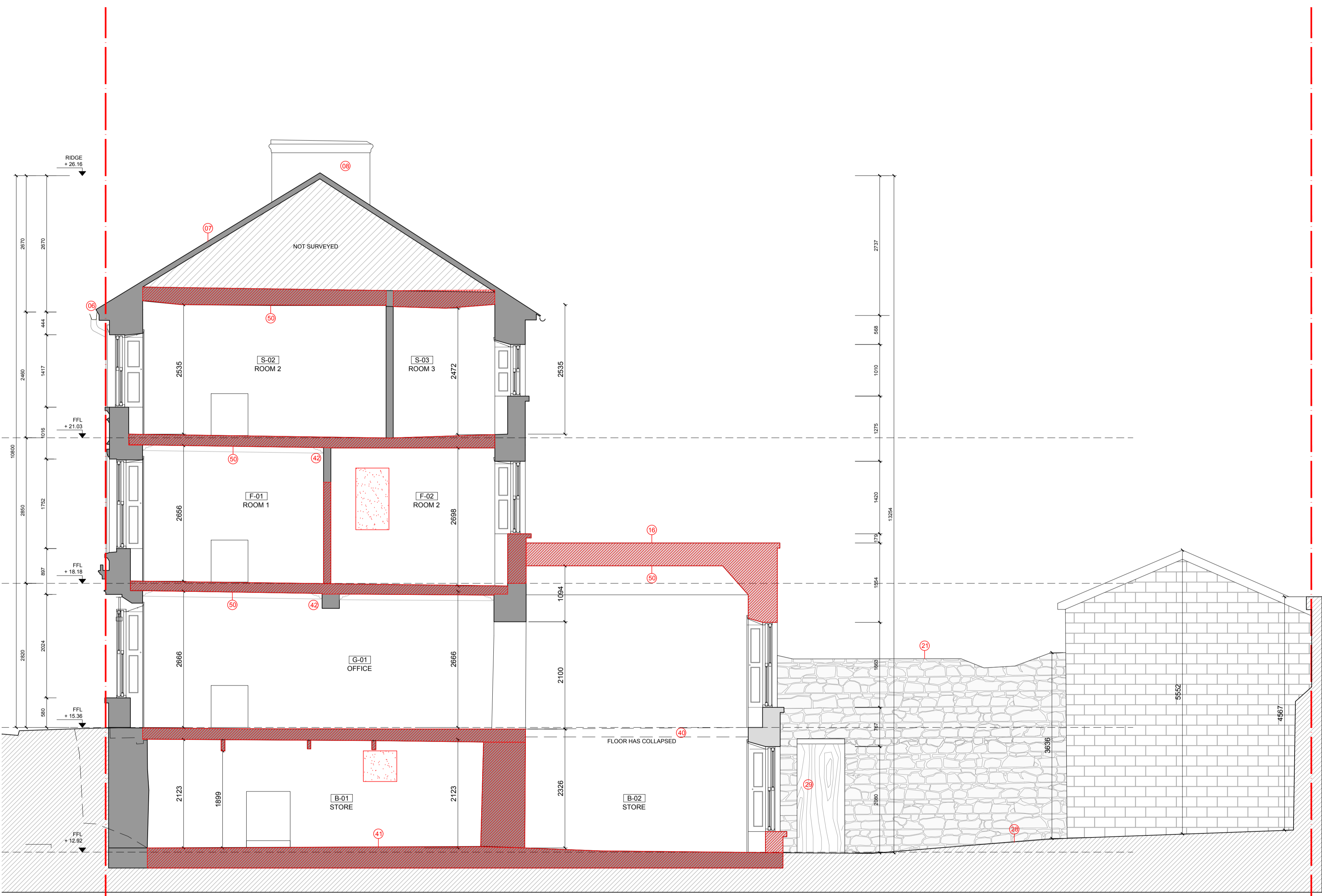
01 EXISTING SECTION AA 1:50