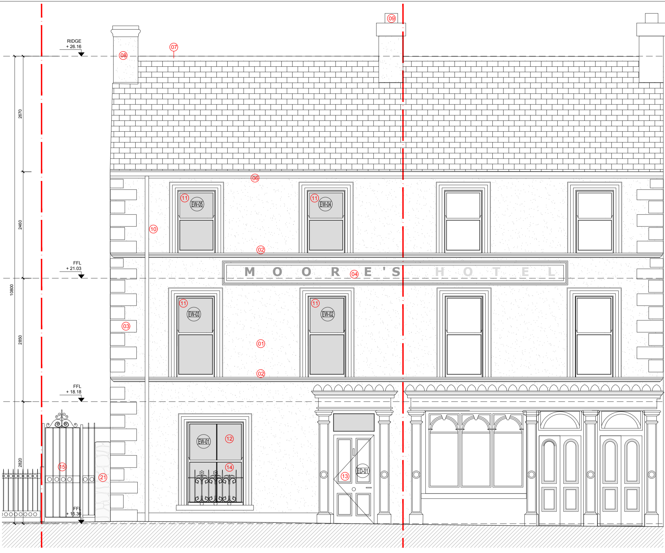
01 EXISTING FRONT ELEVATION 1:50