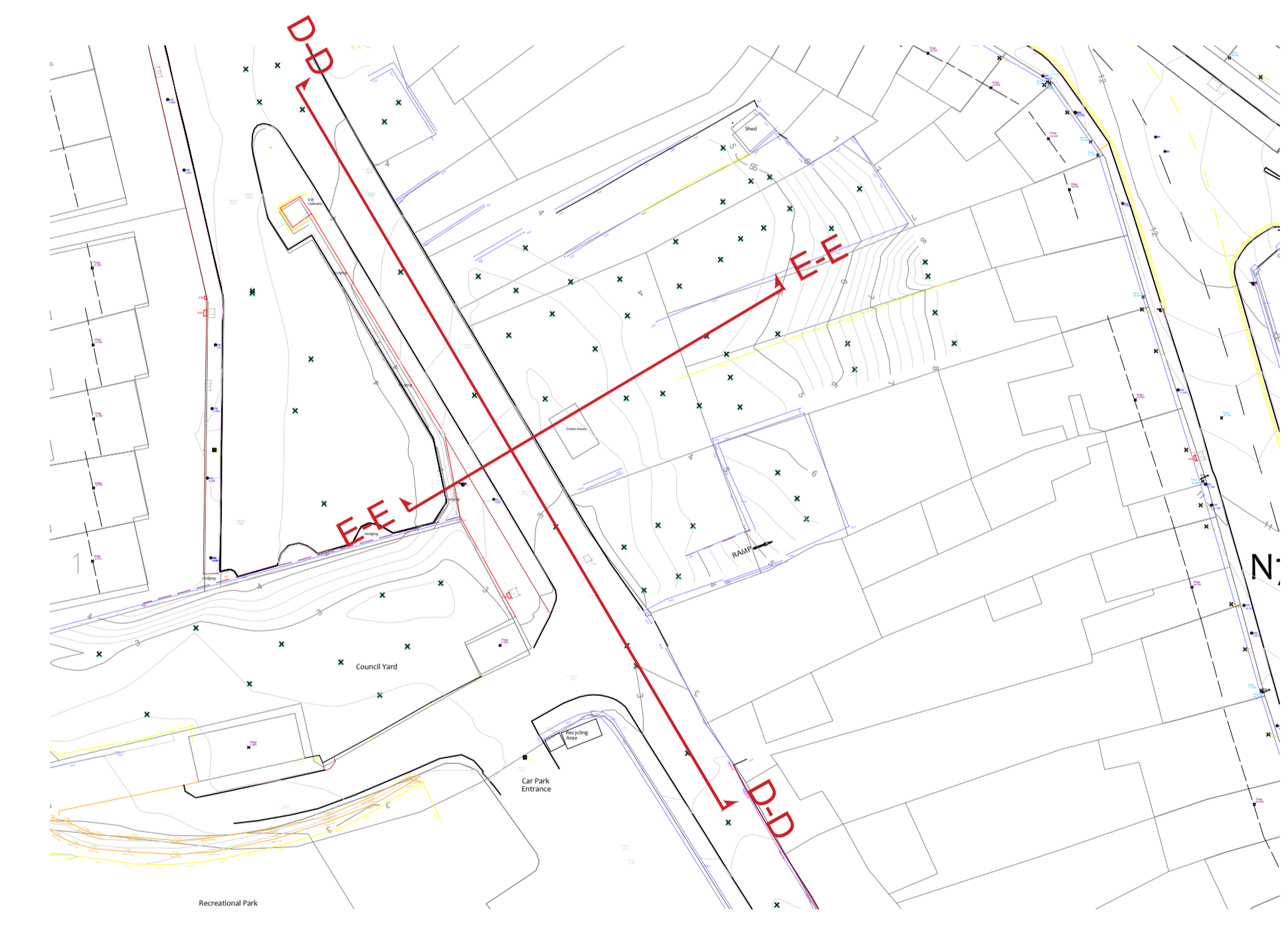
03. Key Plan 1:500