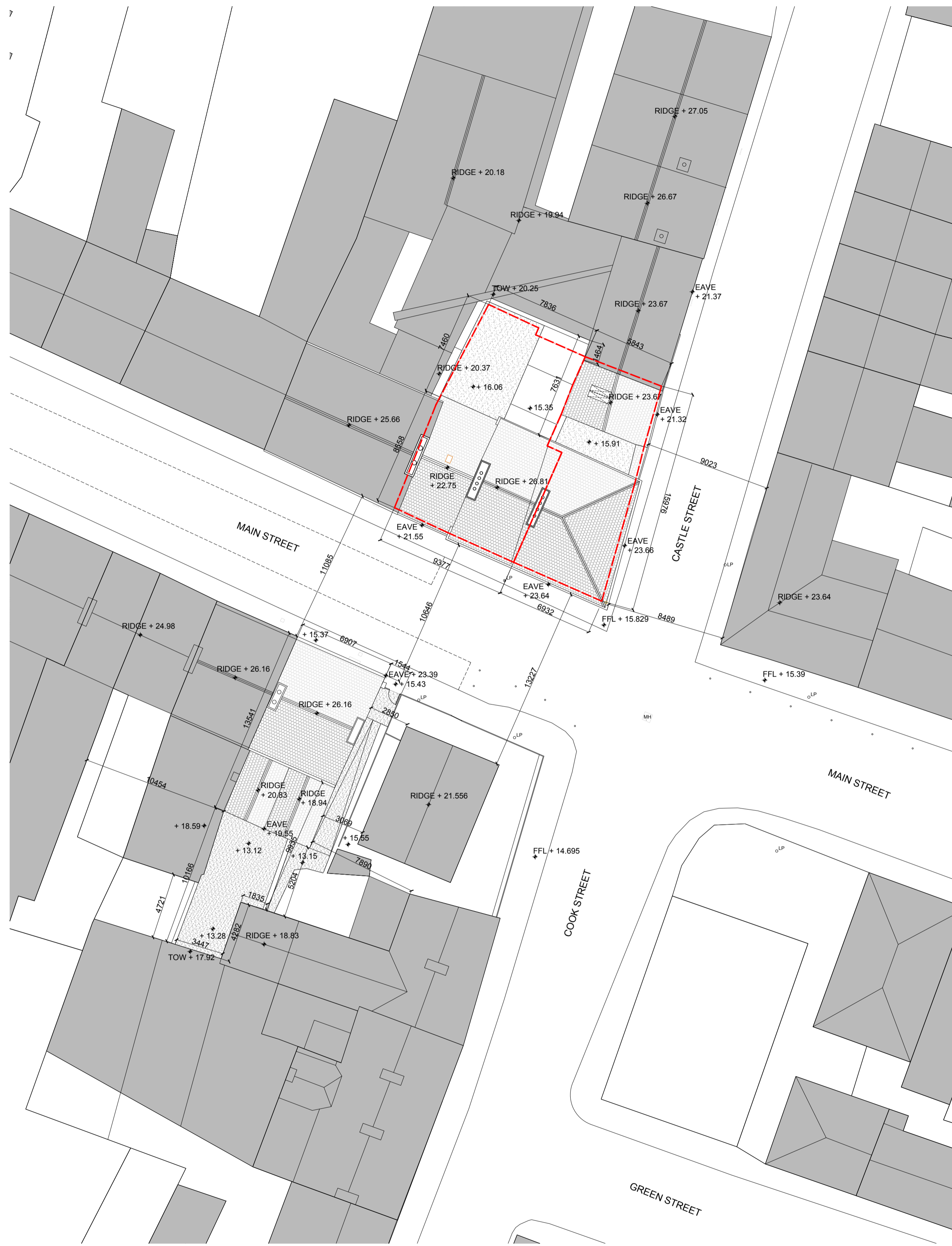
01 EXISTING SITE LAYOUT 1:200

REFER TO THE ENGINEERS DRAWING FOR DRAINAGE