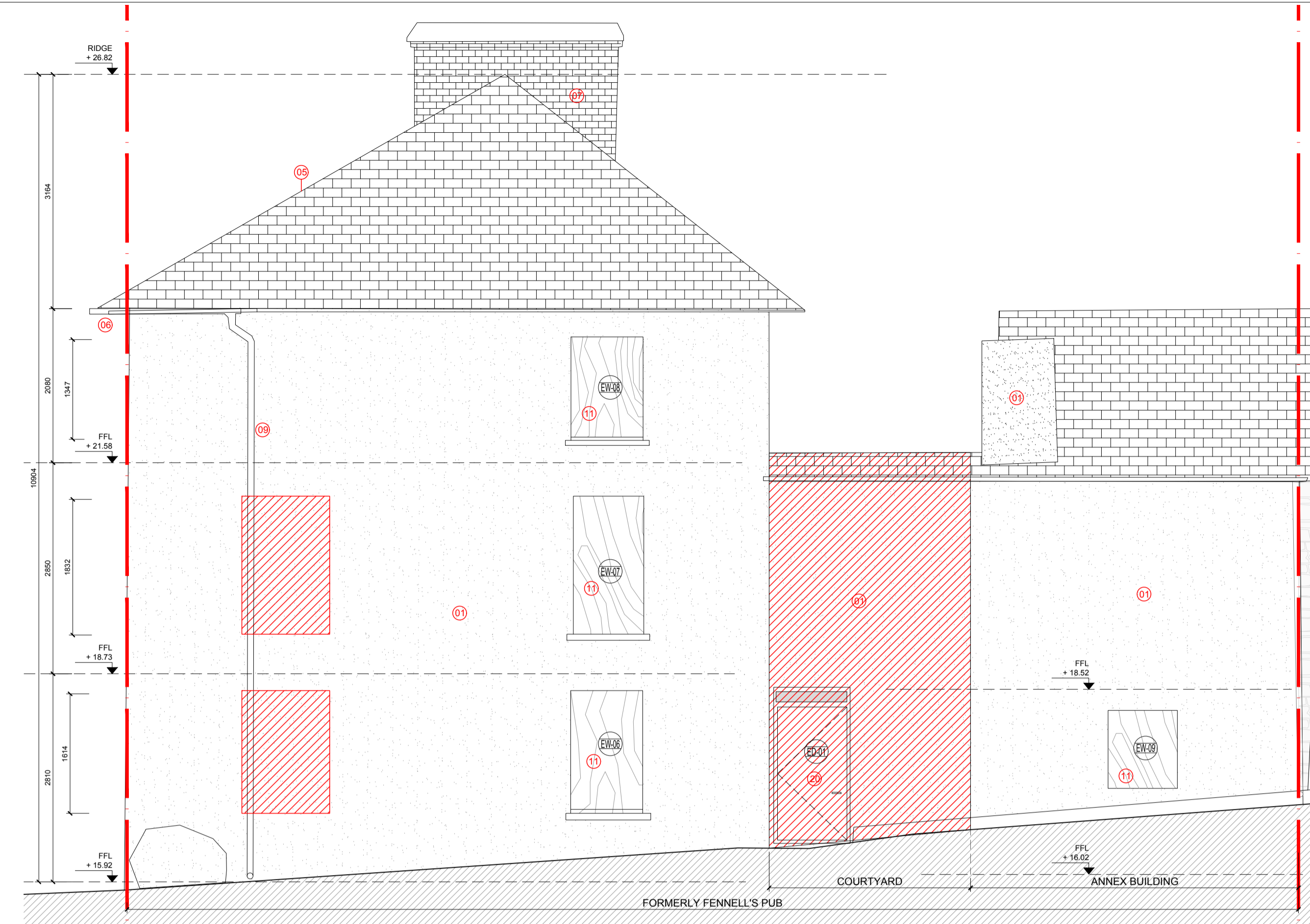
02 EXISTING SIDE ELEVATION - CASTLE STREET 1:50