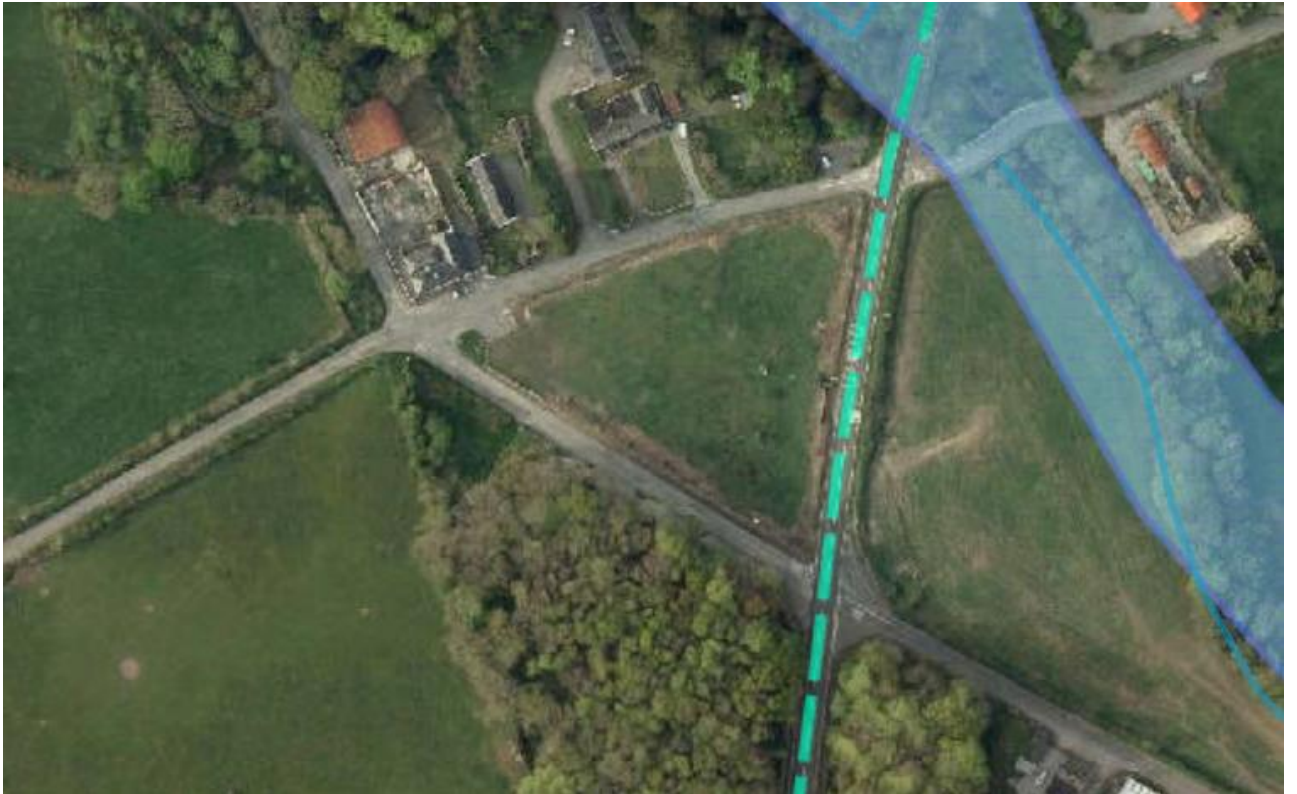
Image 1. Aerial view of proposed car park site at Mahon Bridge